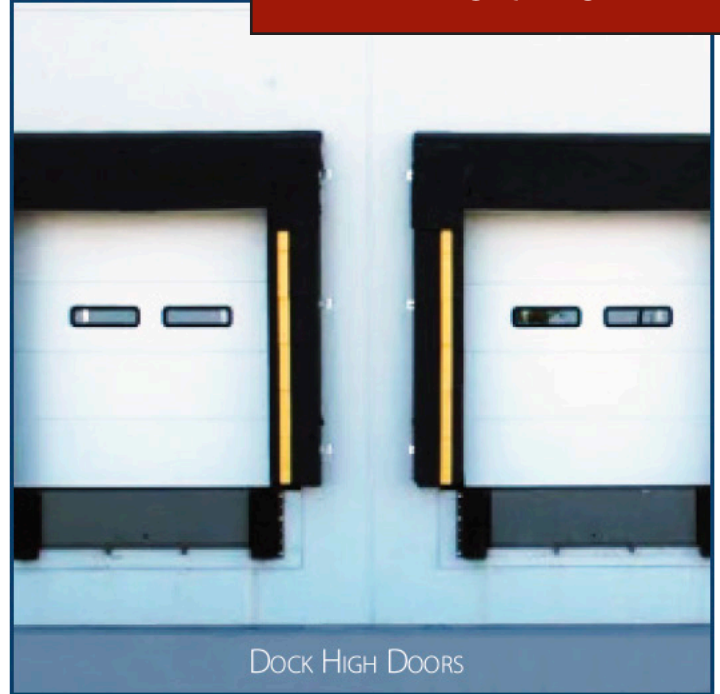
DOCK HIGH DOORS