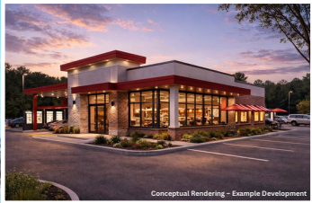
Conceptual Rendering - Example Development