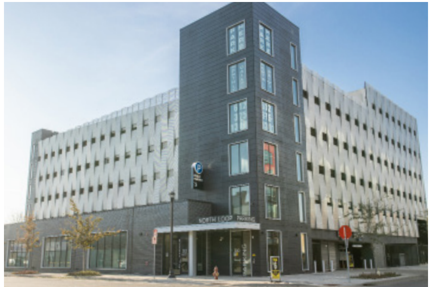
Adjacent, Secure Parking Ramp