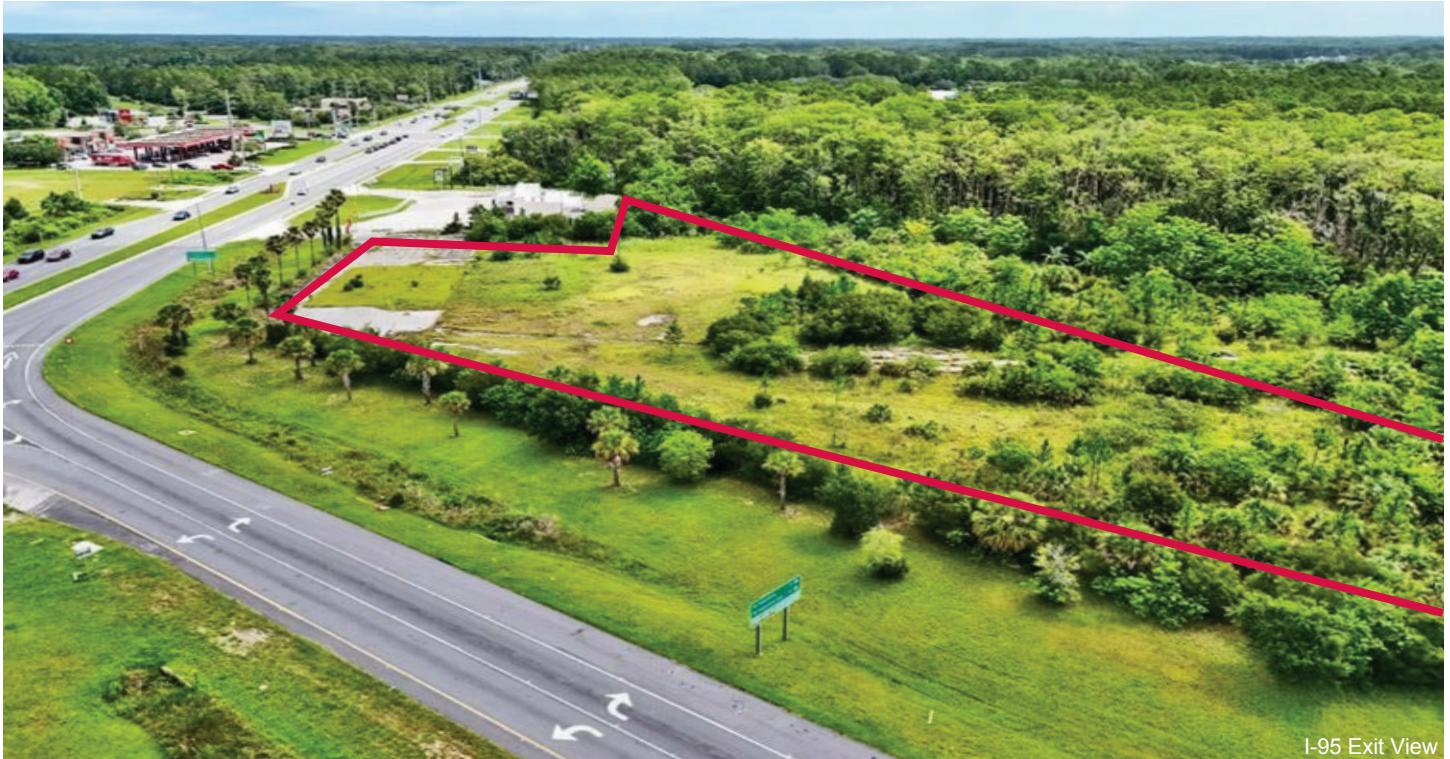
I-95 Exit View

Office: 175 Hampton Point Dr., Suite 3 St. Augustine, FL 32092