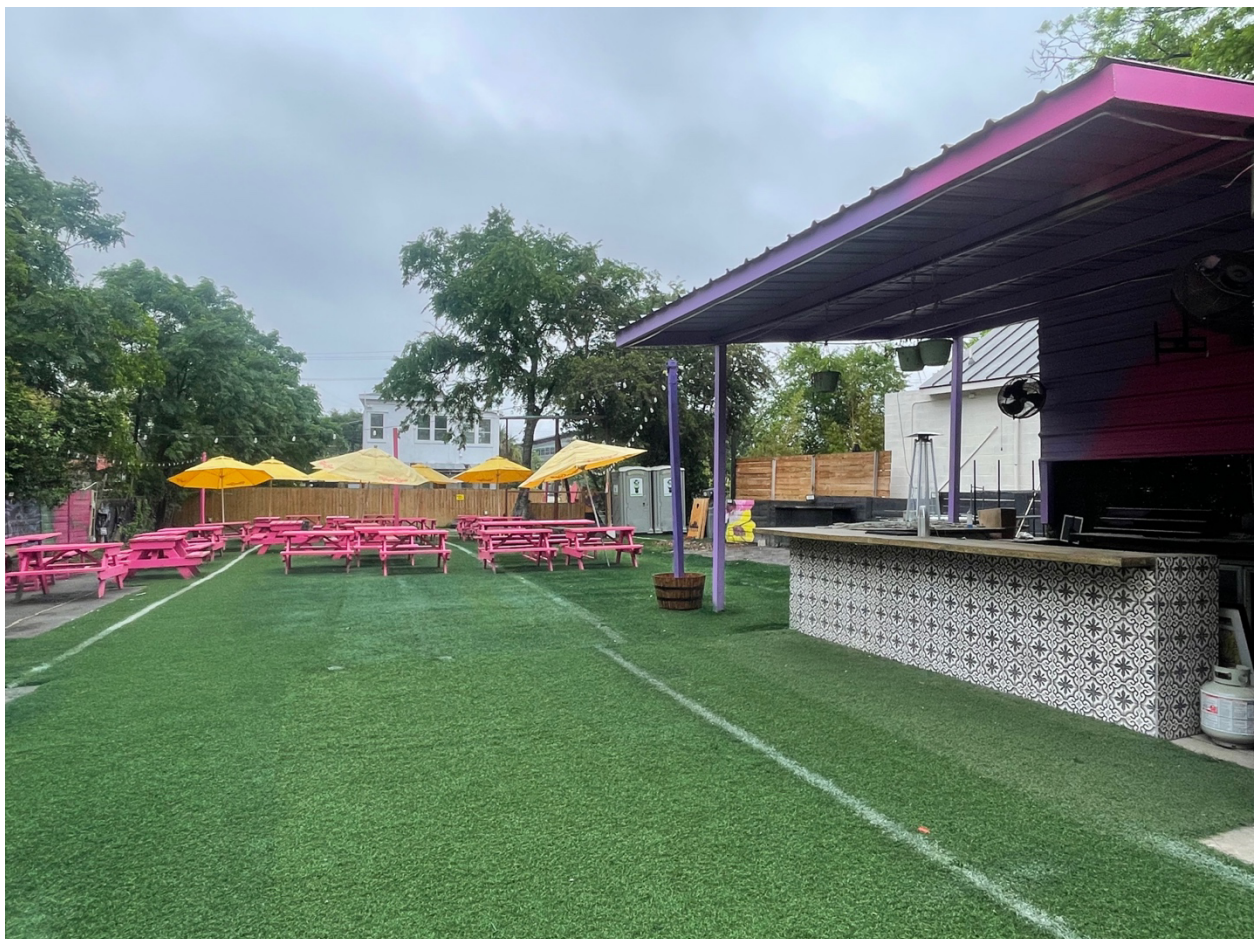
Existing Outdoor bar