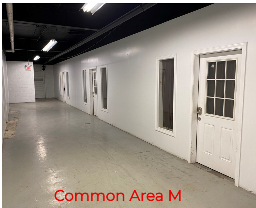
Common Area M