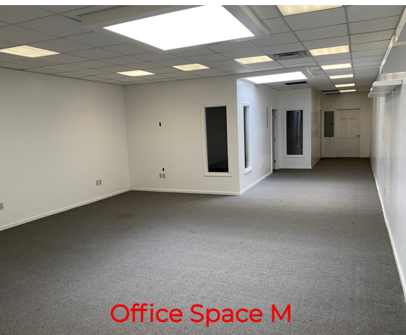
Office Space M