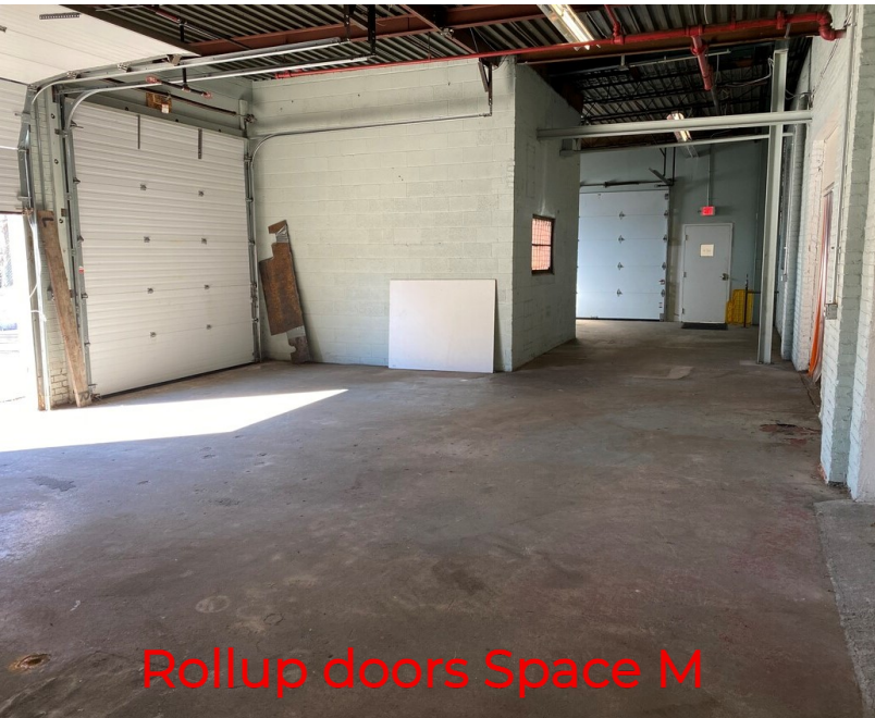
Rollup doors Space M