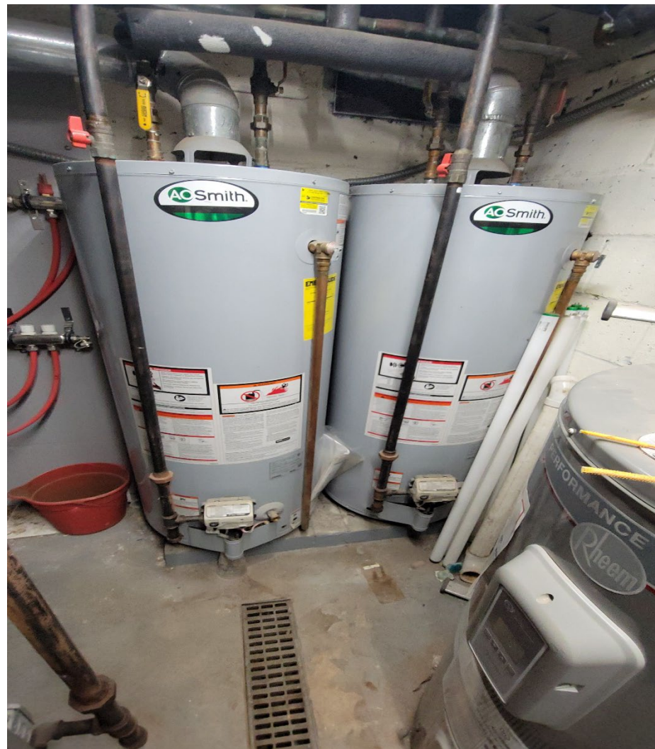
Highly Efficient Utility Systems & Solar Panels on Roof