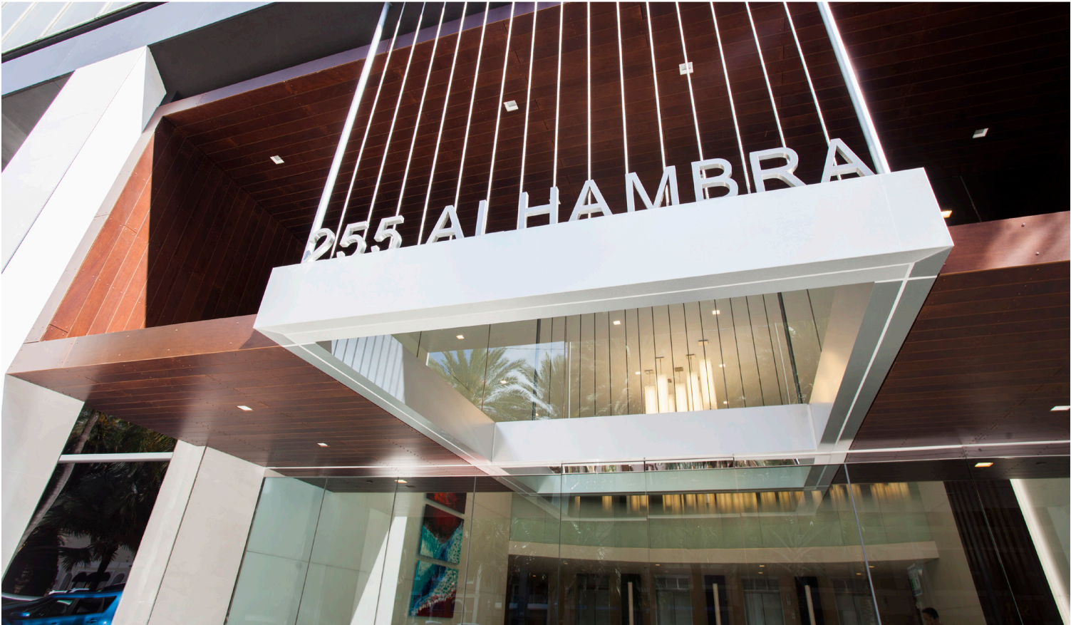
NEW BUILDING ENTRY