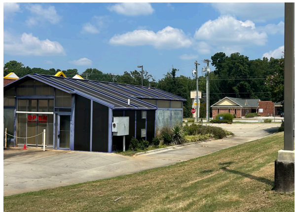
GREENWOOD COUNTY TAX MAP #6856-0808-840