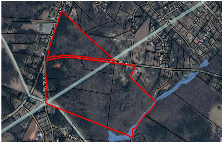
MAP WITH EASEMENTS & FLOOD PLAIN