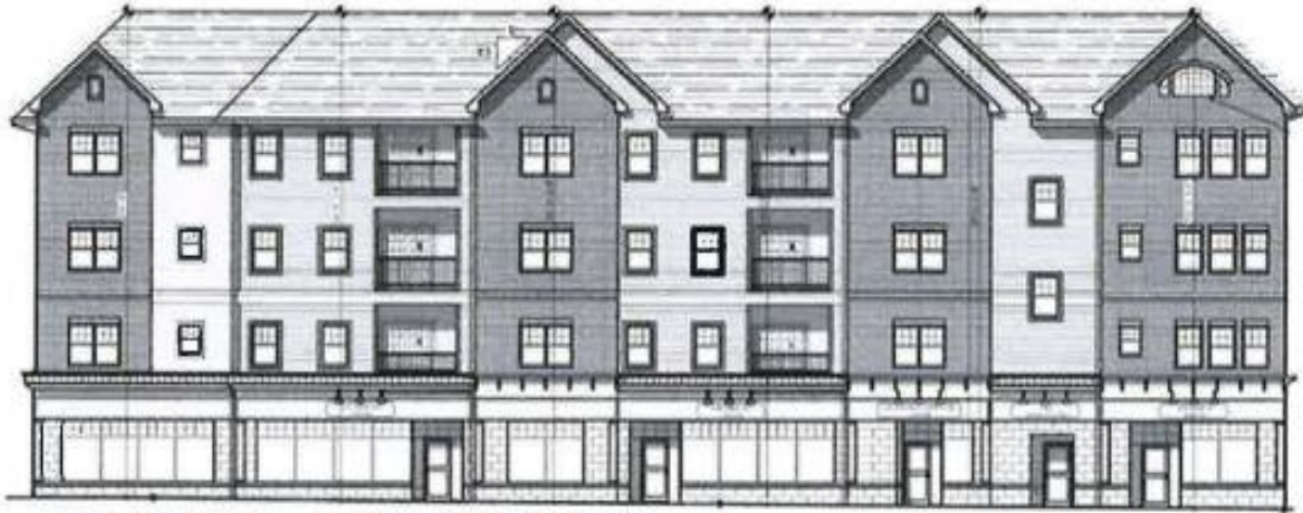
RENDERING - HAMILTON STREET