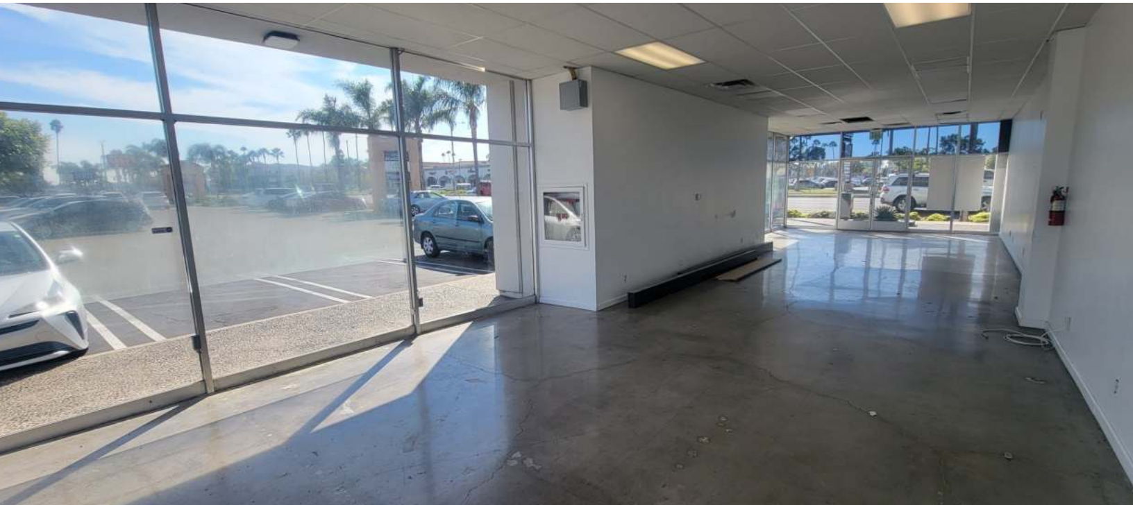
Suite 101 - 1,047 SF