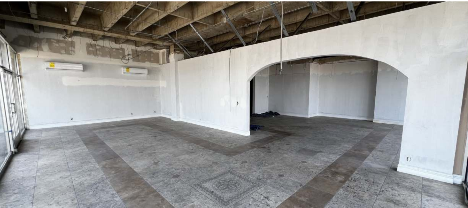
Suite 107/109 - 1,587 SF