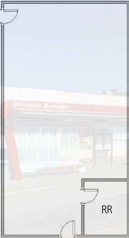
Floor Plan not to scale, for reference purposes only.