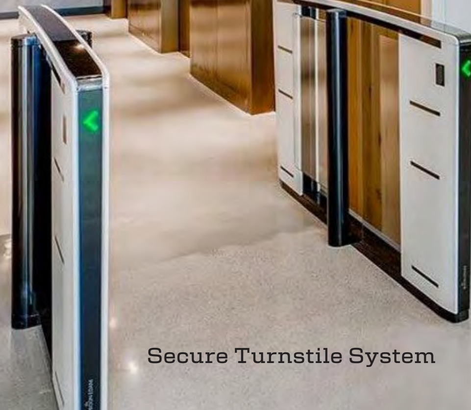
Secure Turnstile System