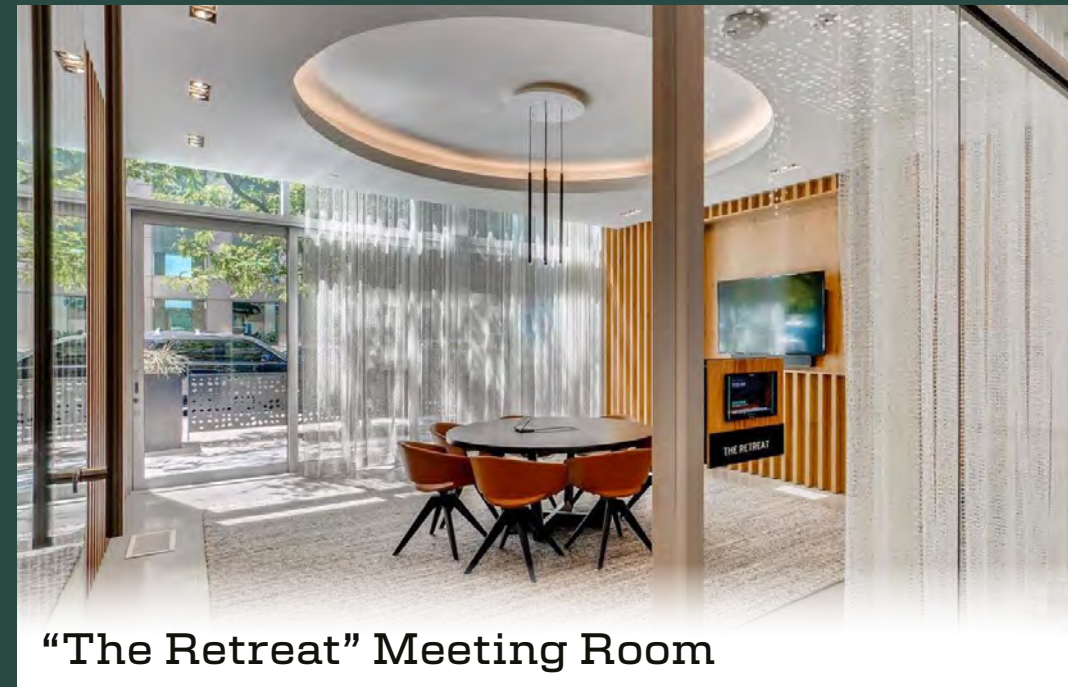
"The Retreat" Meeting Room

Gensler- designed, lively, modern, and inviting lobby areas at The 410