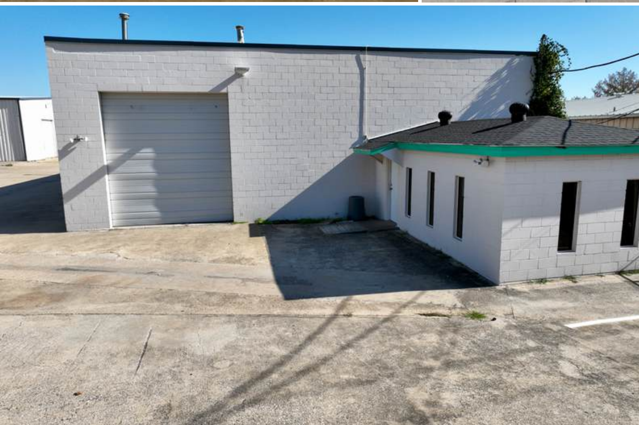
BUILDING 3 | 9,123 SF