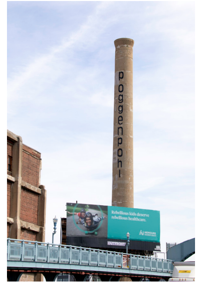
view from eastbound over Ben Franklin