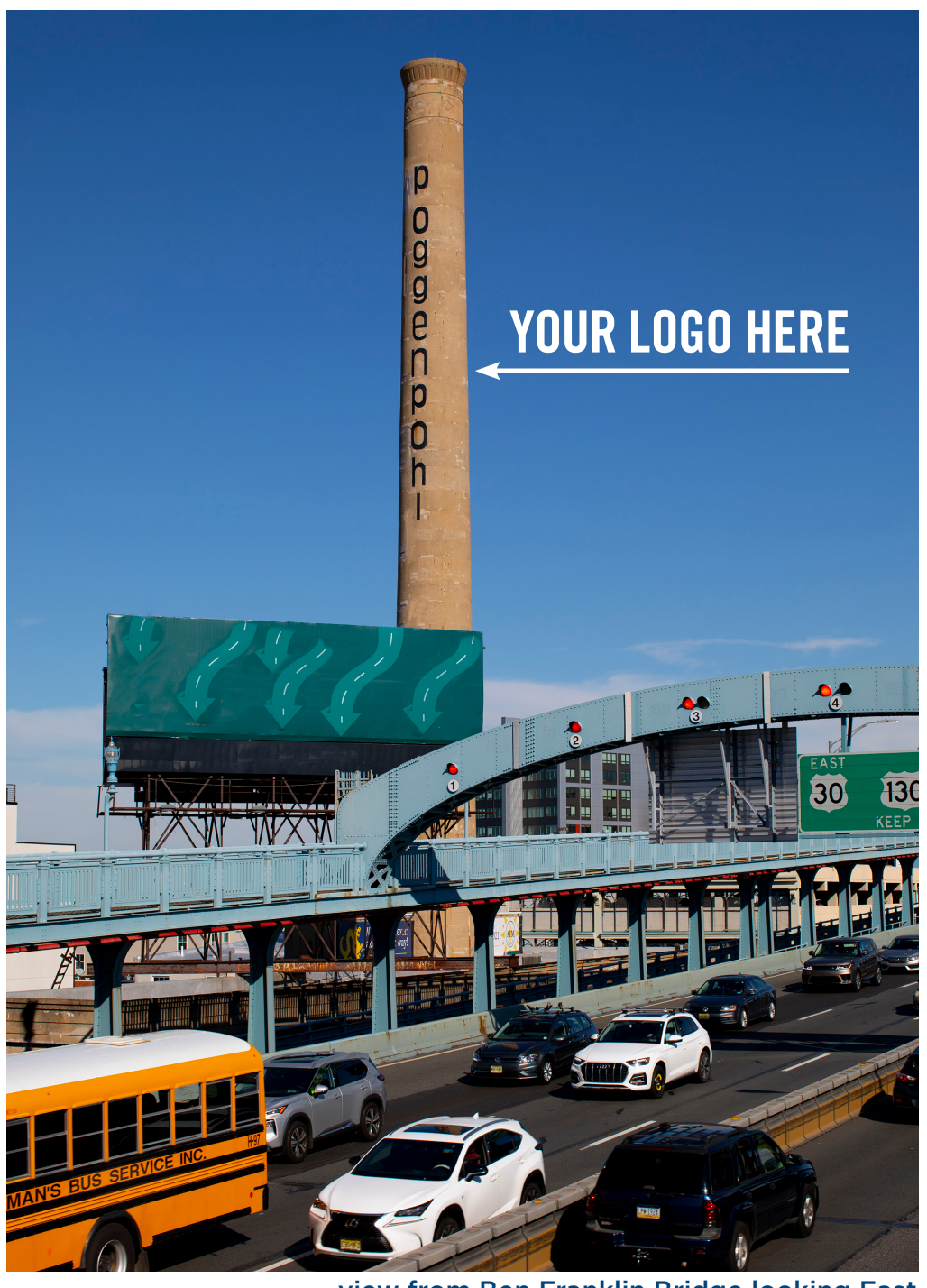
view from Ben Franklin Bridge looking East

STEVEN CLOFINE 267.546.1755 ■ sclofine@mpnrealty.com ROMAN MELNYK 267.238.1716 ■ rmelnyk@mpnrealty.com