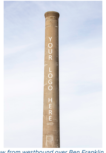
view from westbound over Ben Franklin