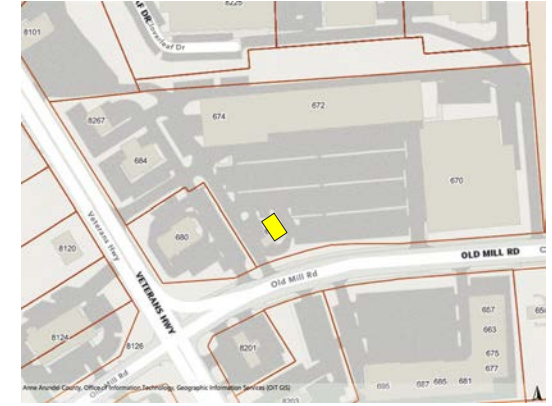
2 SITE KEY PLAN A-1 NOT TO SCALE