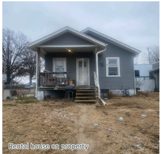
Rental house on property