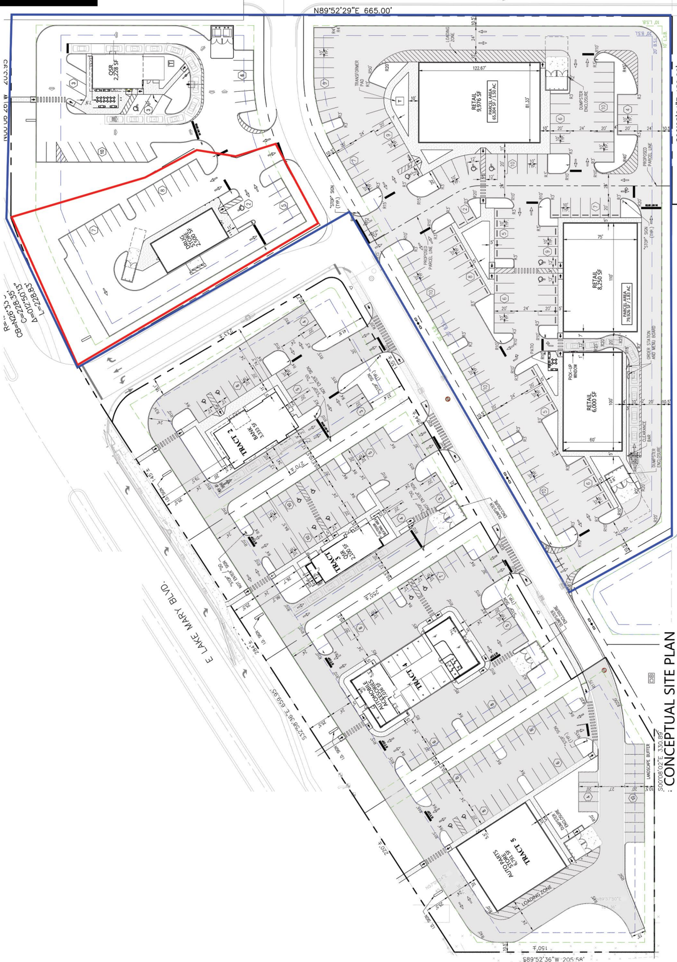
: CONCEPTUAL SITE PLAN