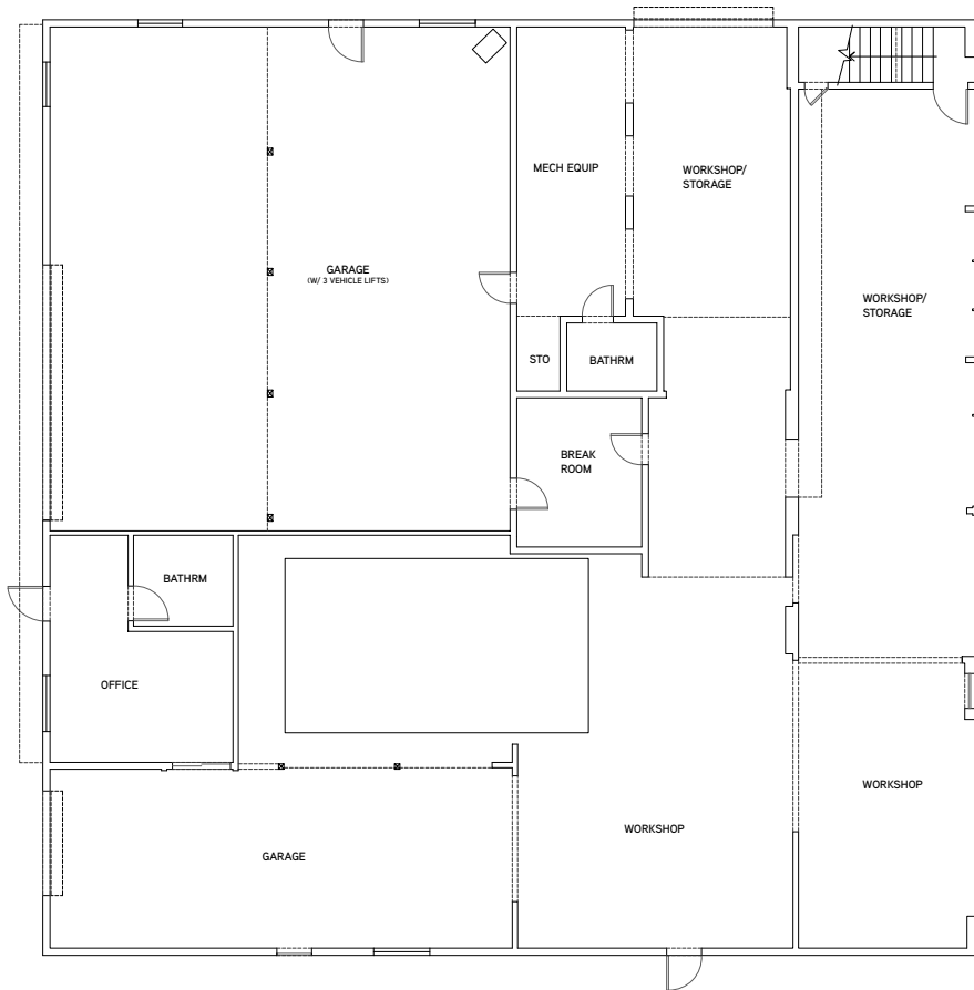
6,472 SF FIRST FLOOR