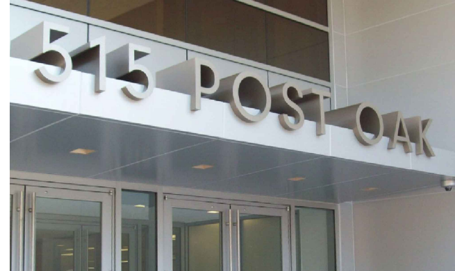
EDGE MOUNTED CANOPY SIGN