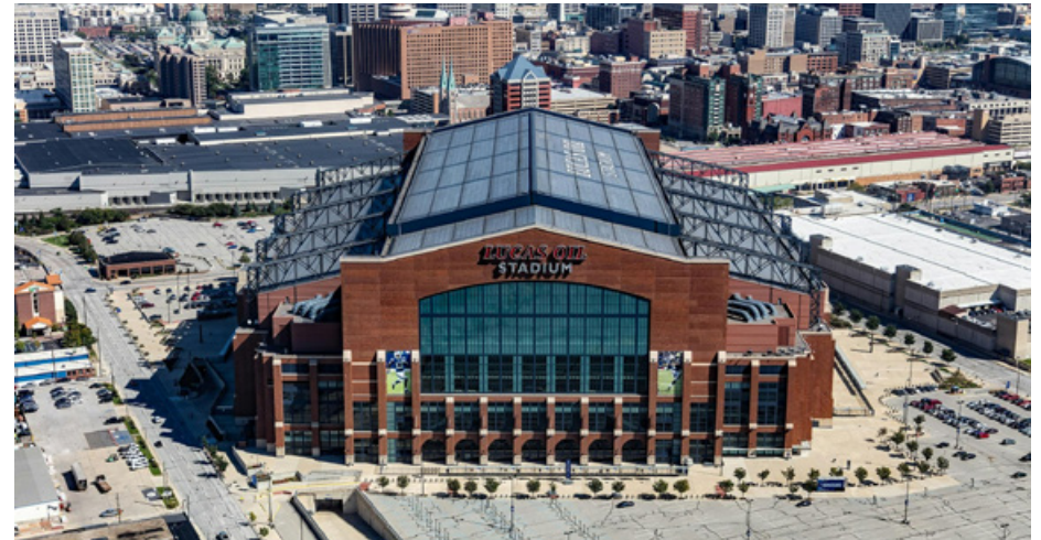
Lucas Oil Stadium - Indianapolis, IN