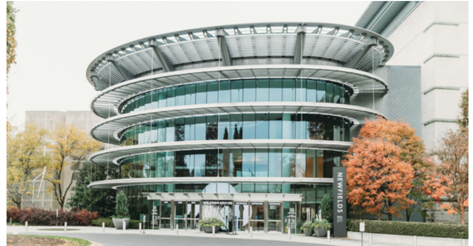
Indianapolis Museum of Art