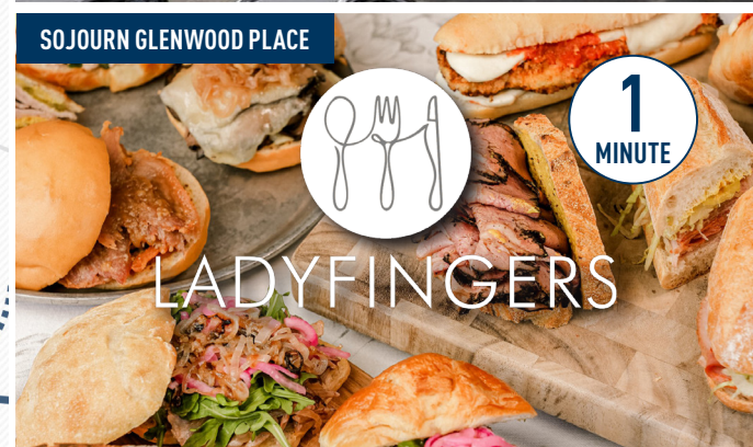
SOJOURN GLENWOOD PLACE