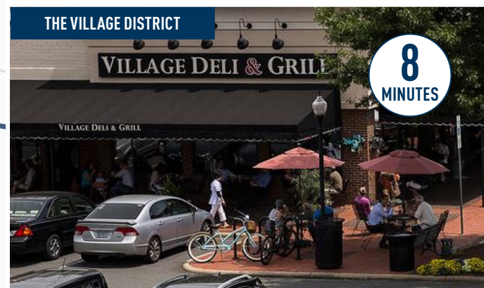
THE VILLAGE DISTRICT