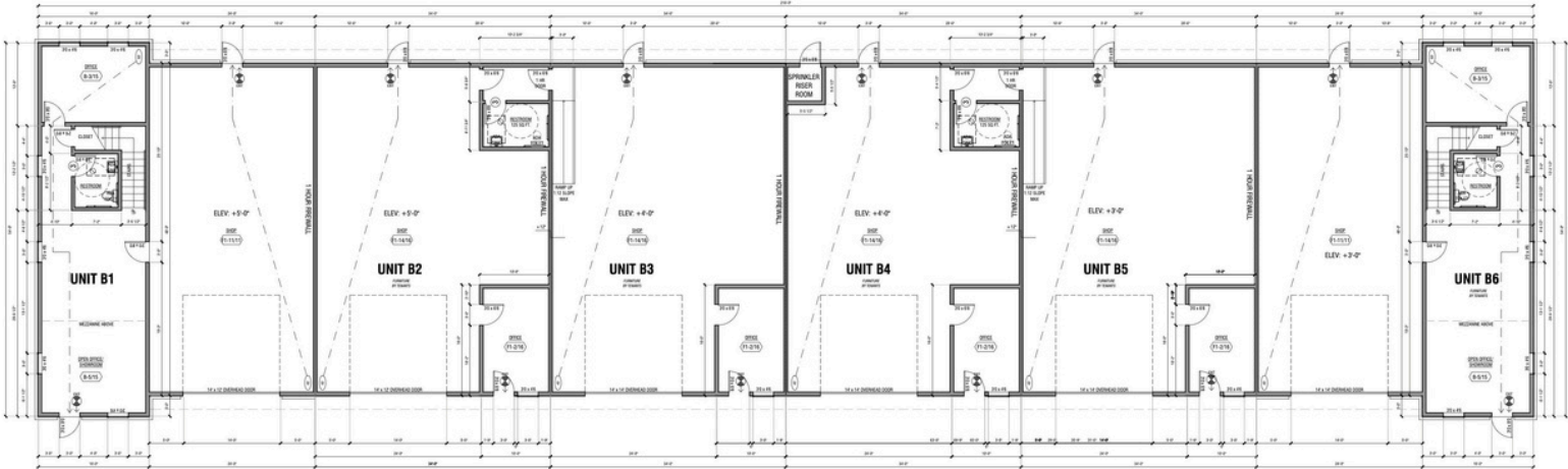
1 MAIN FLOOR PLAN - BUILDING B SCALE 3/8" = 1'-0"