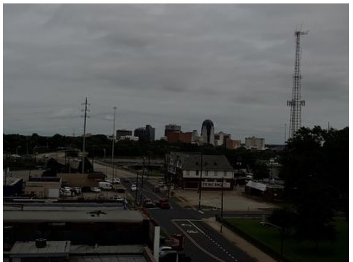
View from the Roof