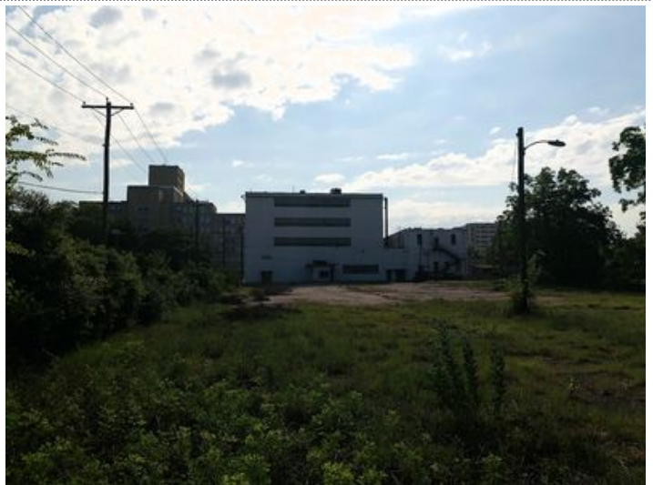
From Parking Lot