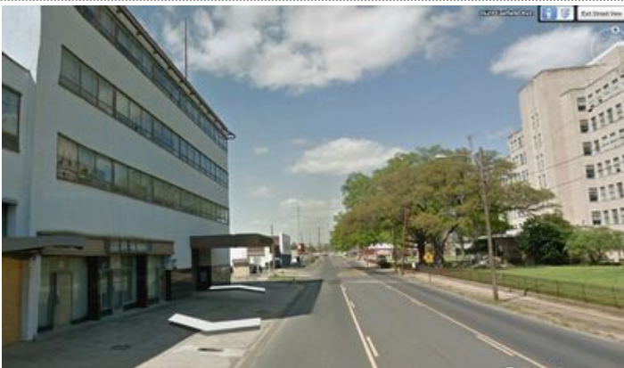
1600 Fairfield Approach