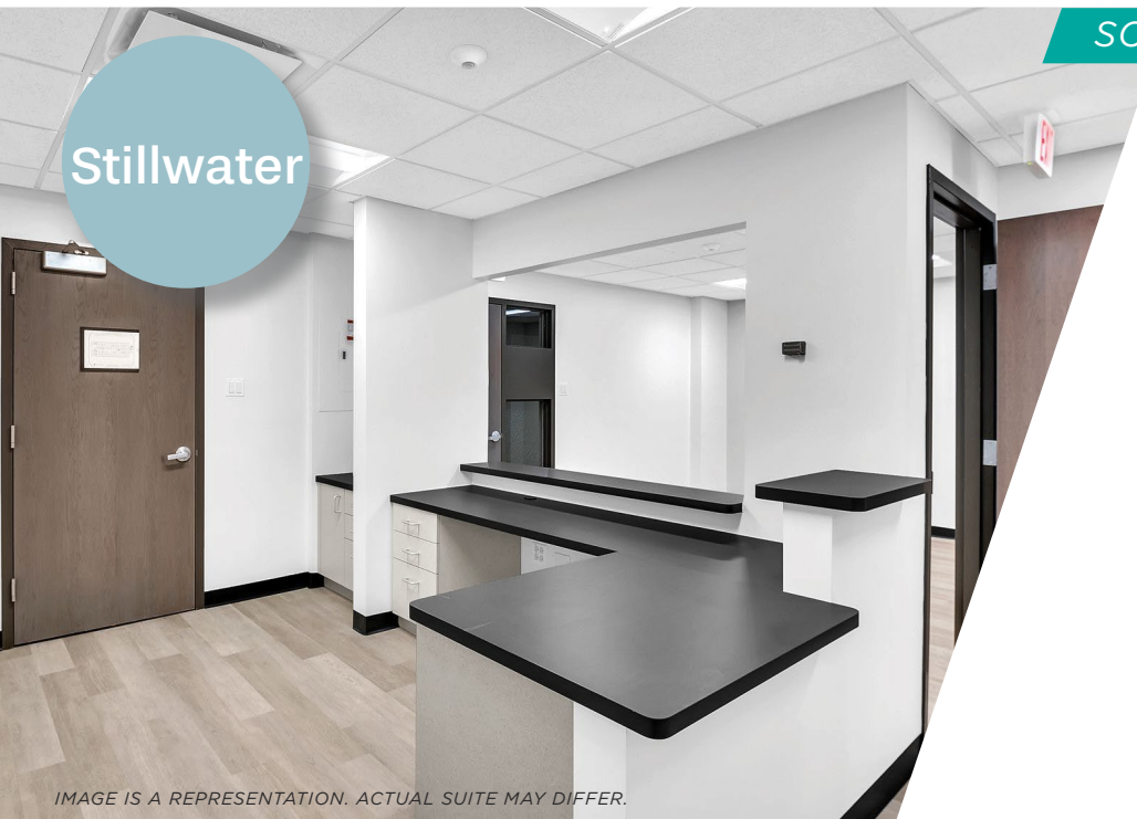
IMAGE IS A REPRESENTATION. ACTUAL SUITE MAY DIFFER.