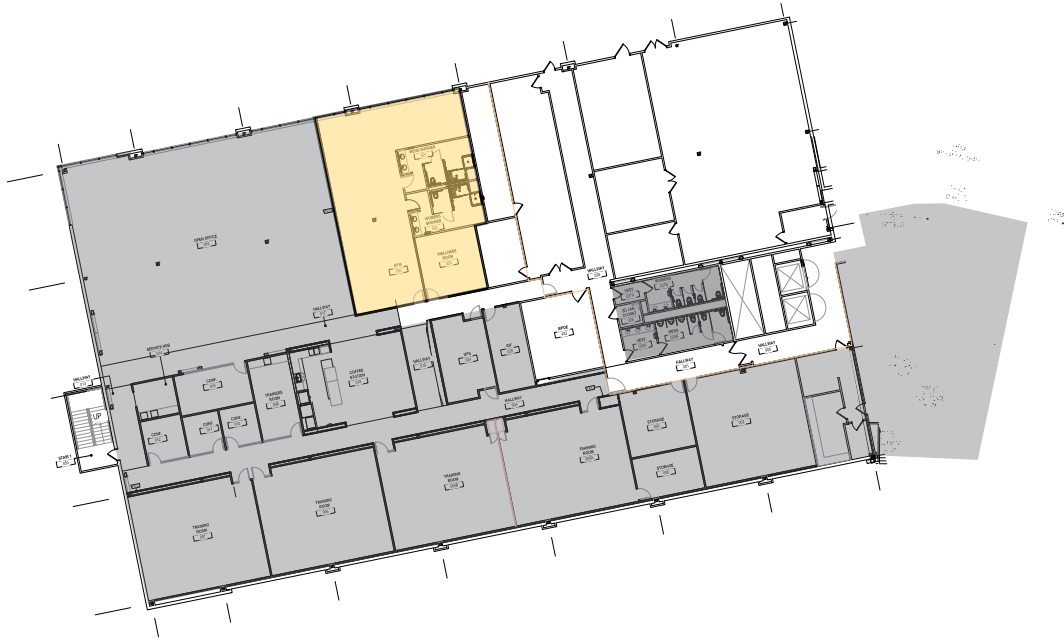
Fitness Center ■