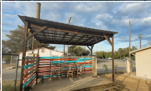
PATIO AREA - STAGE - 16' W X 12' D