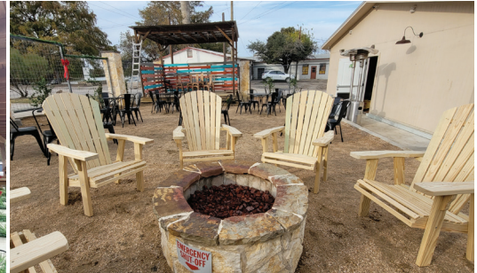
PATIO AREA - FIRE PIT & STAGE