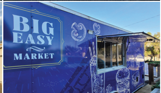
PATIO AREA - FOOD TRAILER SPACE