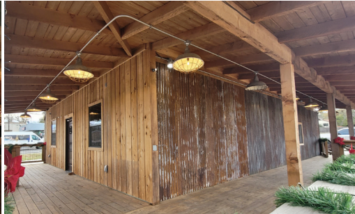
BUILDING ONE - WRAP AROUND COVERED PORCH