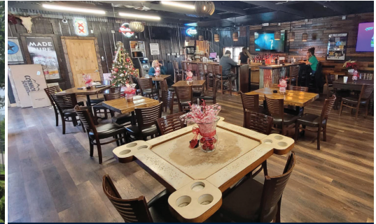
BUILDING ONE INTERIOR