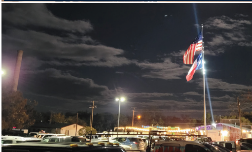
LARGEST FLAGPOLE IN TAYLOR