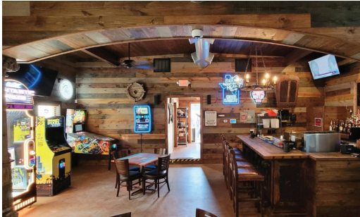
BUILDING TWO INTERIOR