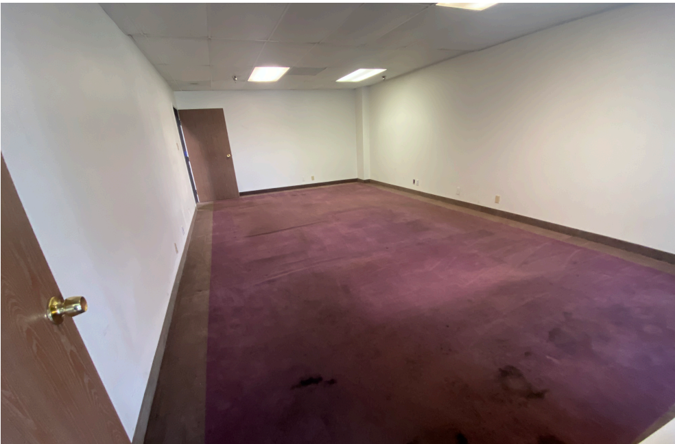
Automotive & Motorhome Accessories Showroom and Customer Lounge area with TV and Coffee.