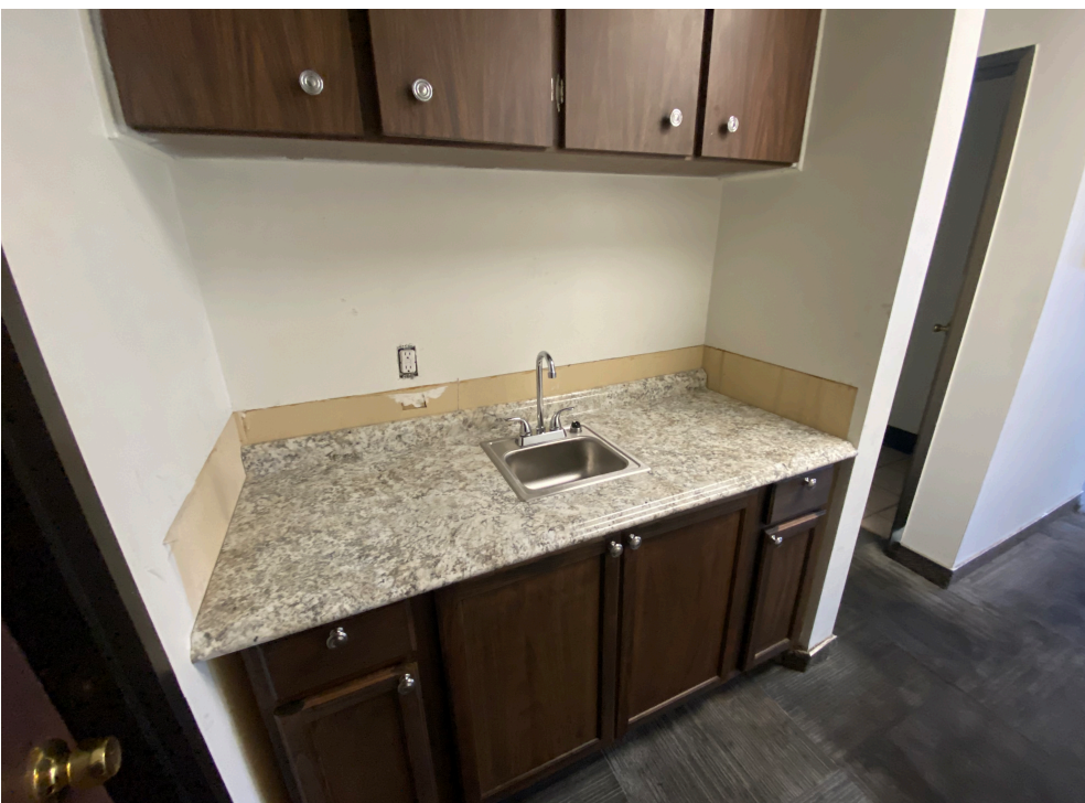
Handy, well-located Kitchenette with wet bar sink.