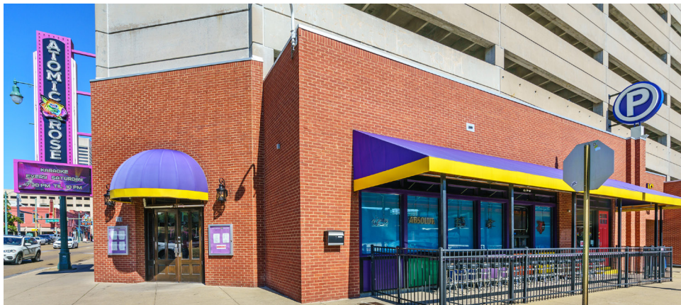
4,485± SF Available Suite