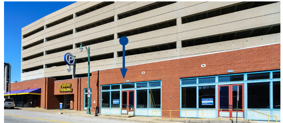
3,635± SF Available Suite