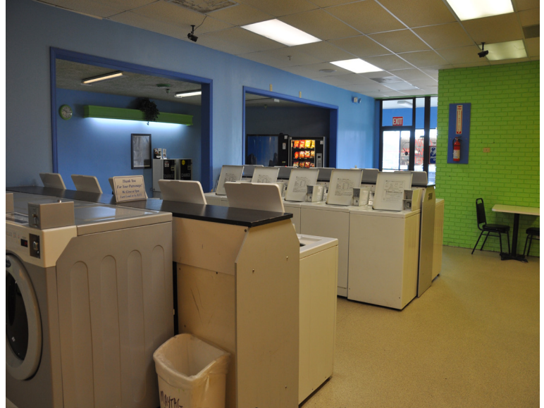
Laundromat (well maintained)