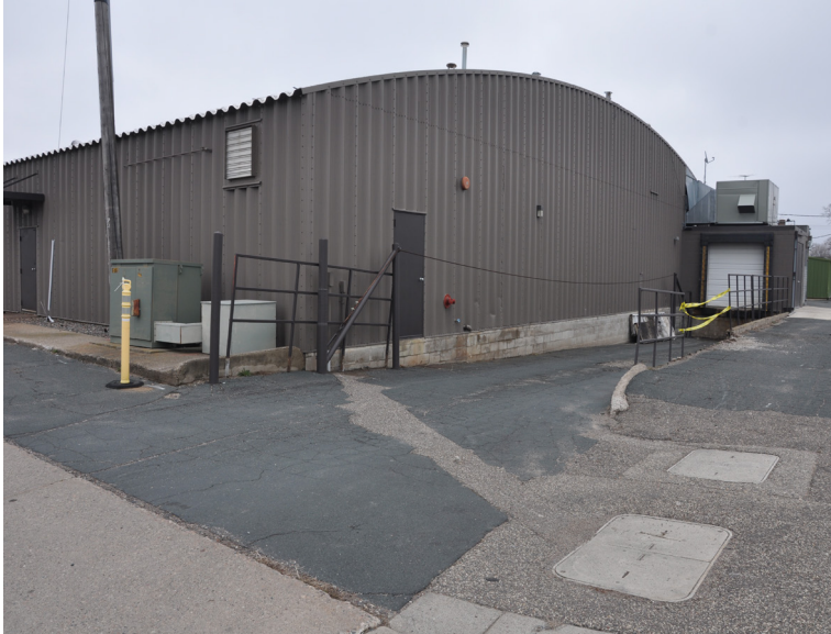
Rear of Building has Loading Dock