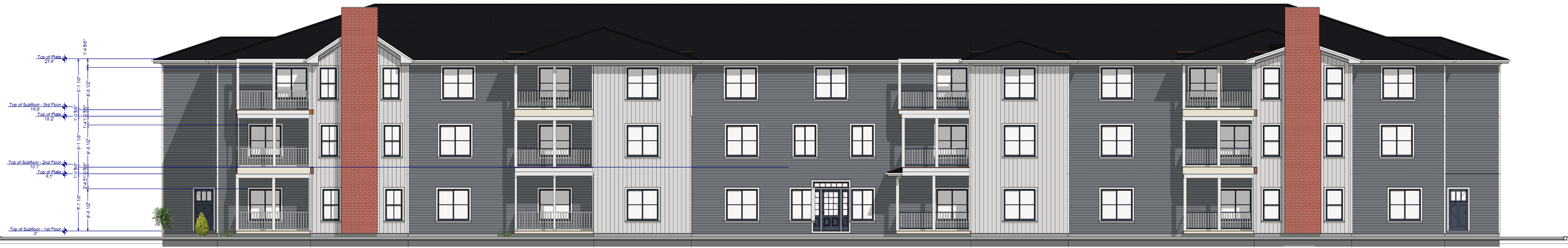
2 A-1A FRONT ELEVATION SCALE: 1/8" = 1'-0"