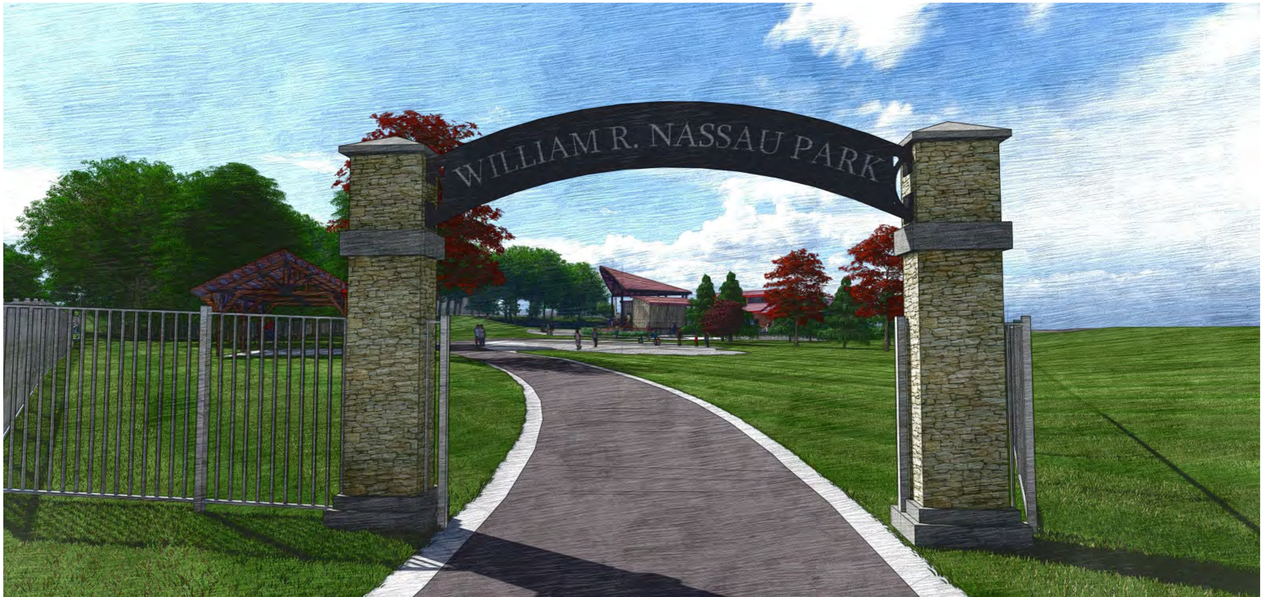
WILLIAM R. NASSAU PARK TOWN OF LOWELL, INDIANA JANUARY 23, 2023