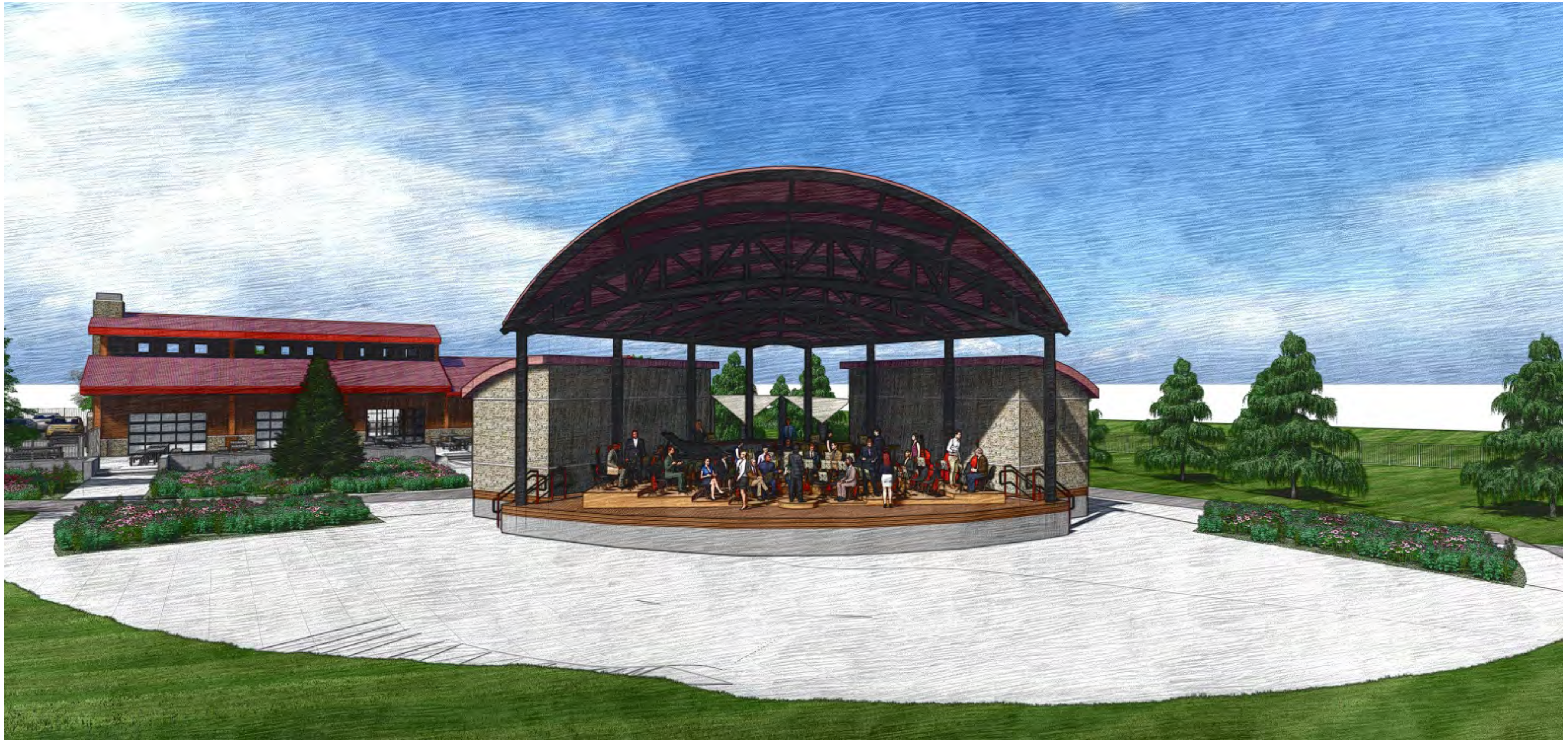
WILLIAM R. NASSAU PARK TOWN OF LOWELL, INDIANA JANUARY 23, 2023