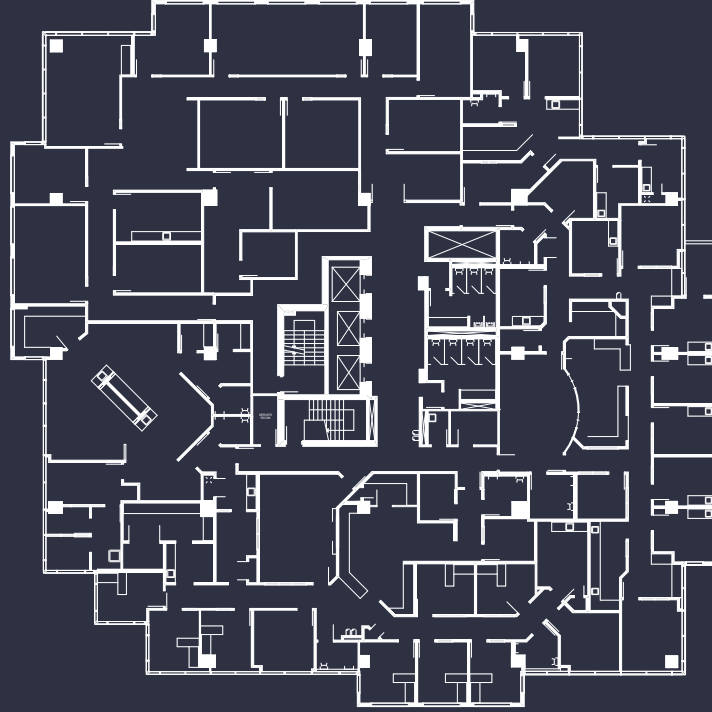
AVENTURA CORPORATE CENTER I