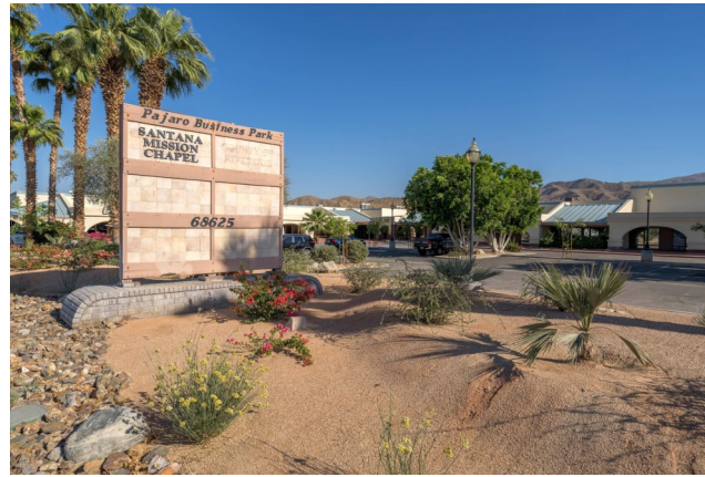
HIGHLY VISABLE SIGNAGE ON PEREZ RD