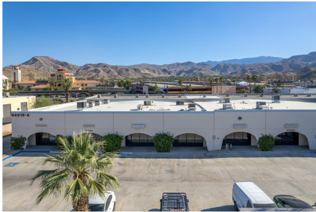
FRONT WITH PARKING FOR UNITS 1-8