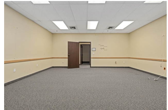
UNIT 3-7 LARGE CONFERENCE ROOM