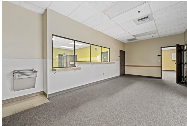
UNIT 8 LOBBY AREA