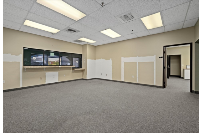
UNIT 8 OFFICE AREA