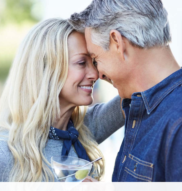
"WHERE THE RANCH SHOPS"