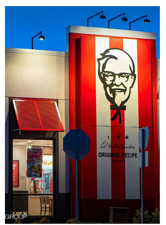
KFC 201 S China Lake Blvd, Ridgecrest, CA 93555