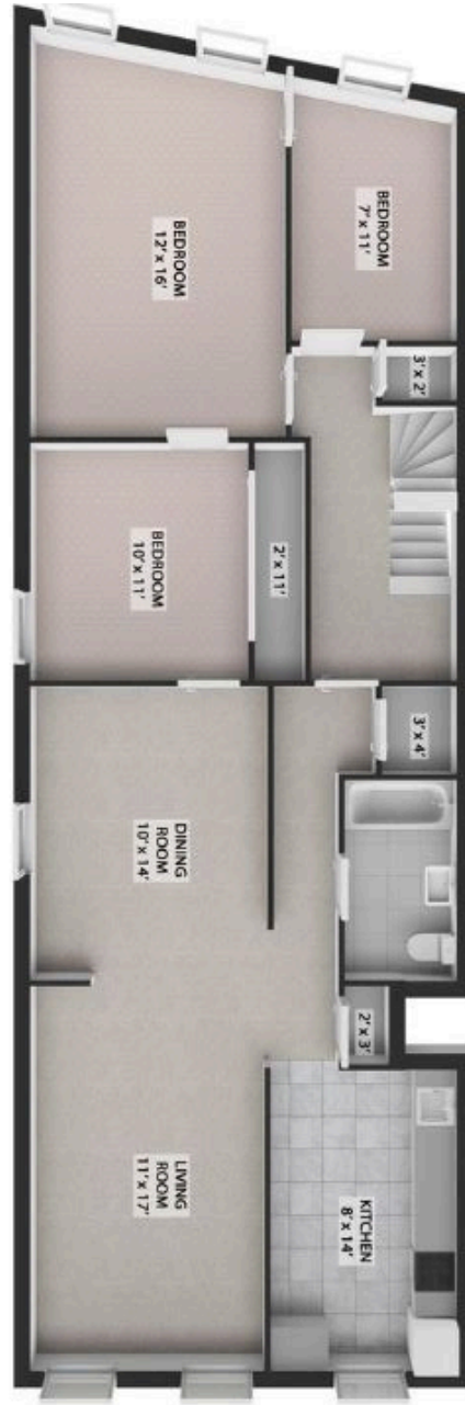
2nd Fl Apt.