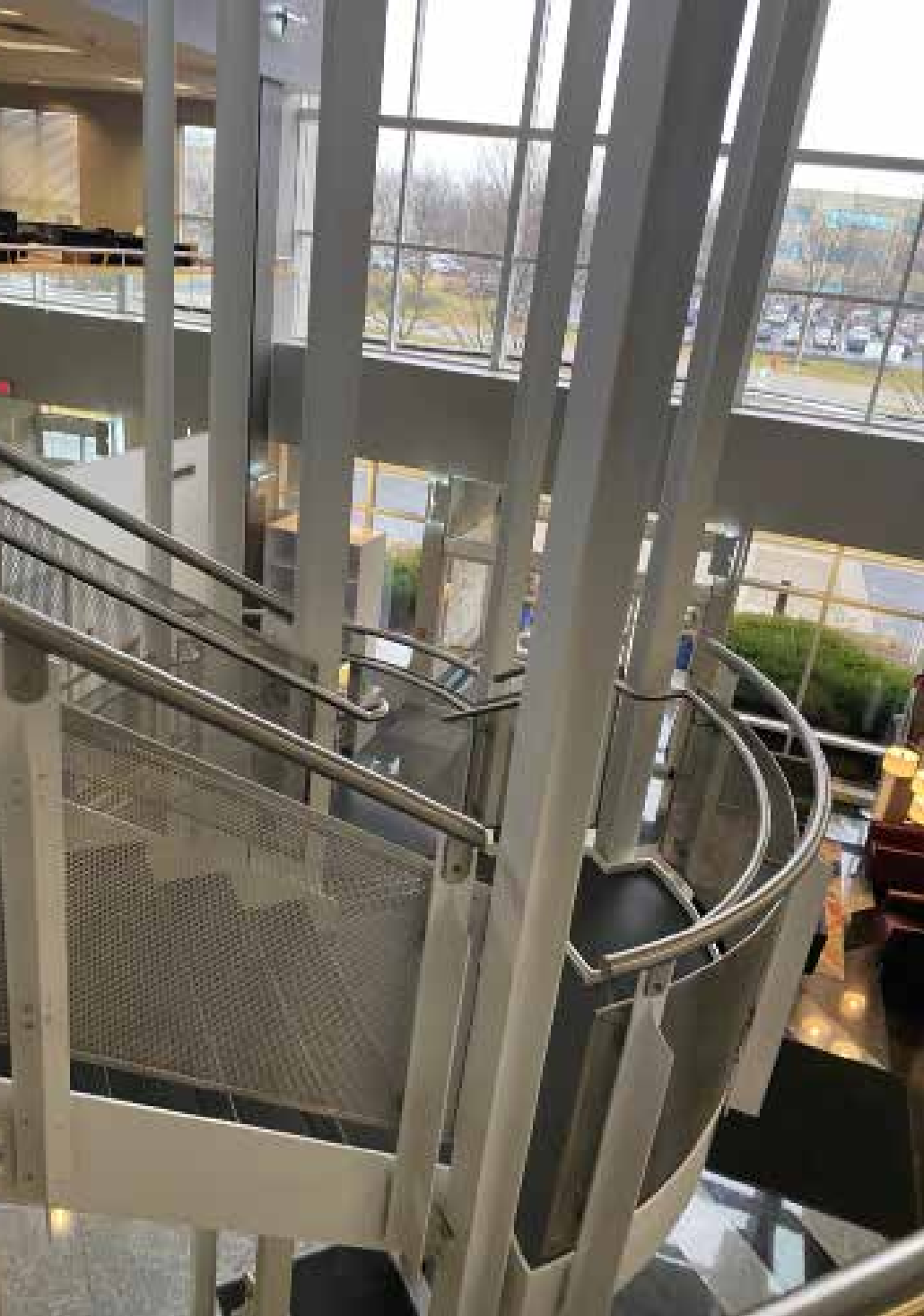
4520 Weaver Parkway, Warrenville, IL