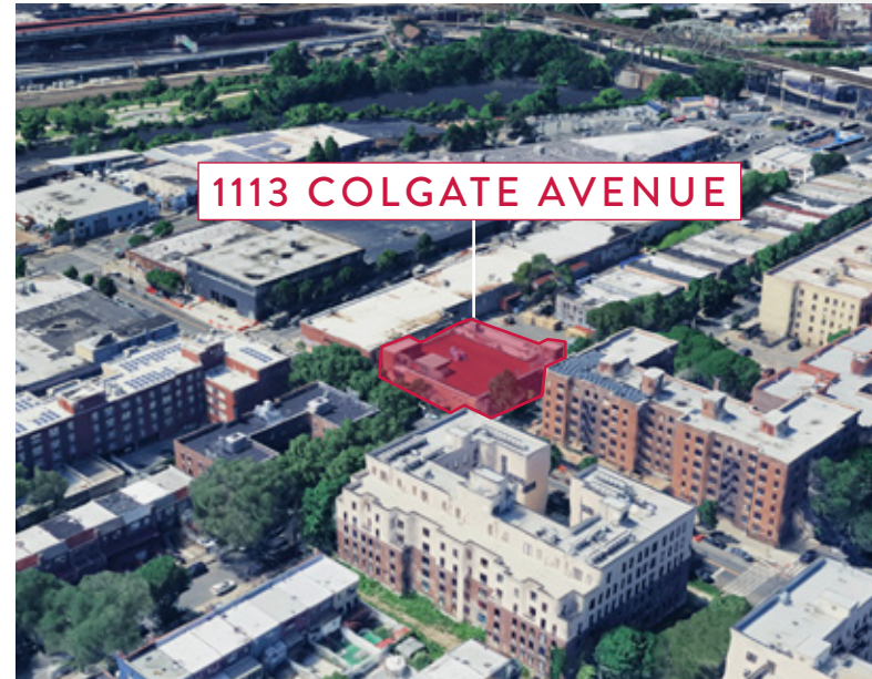
1113 COLGATE AVENUE