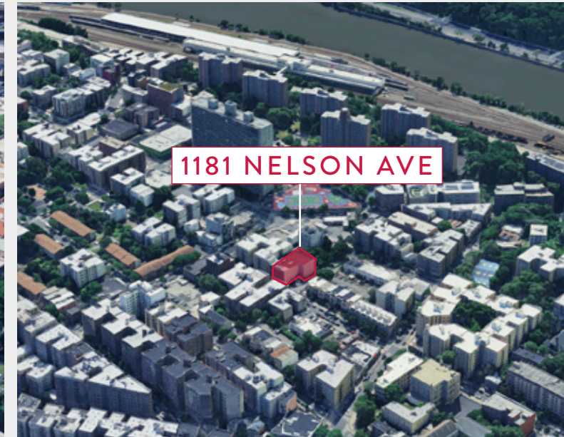
1181 NELSON AVE