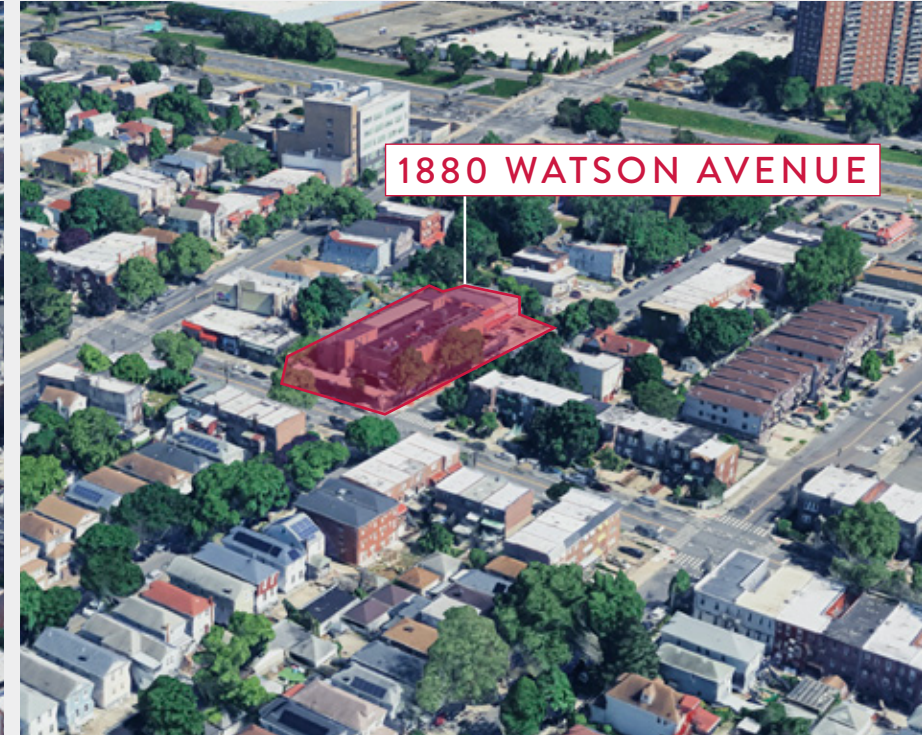
1880 WATSON AVENUE