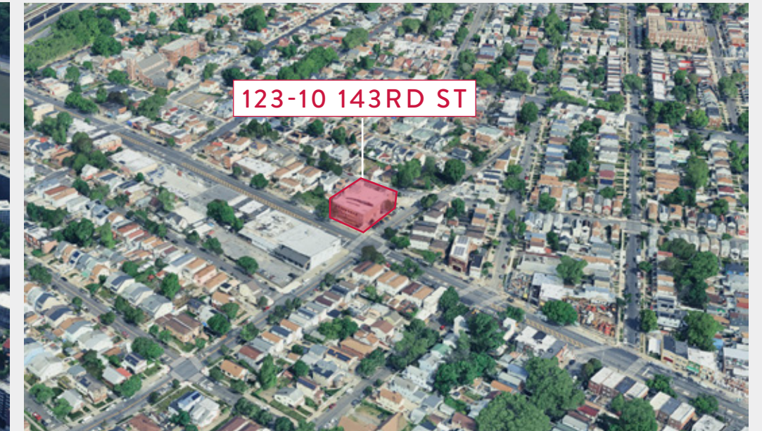
123-10 143RD ST