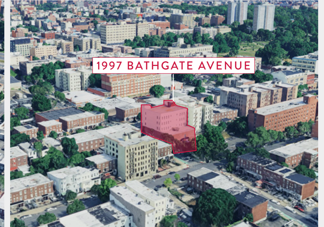
1997 BATHGATE AVENUE