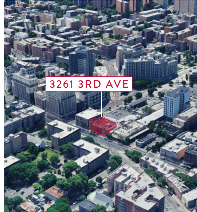
3261 3RD AVE