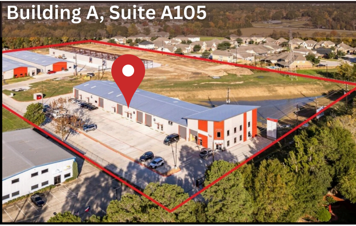
Building A, Suite A105