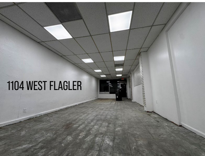
1104 WEST FLAGLER