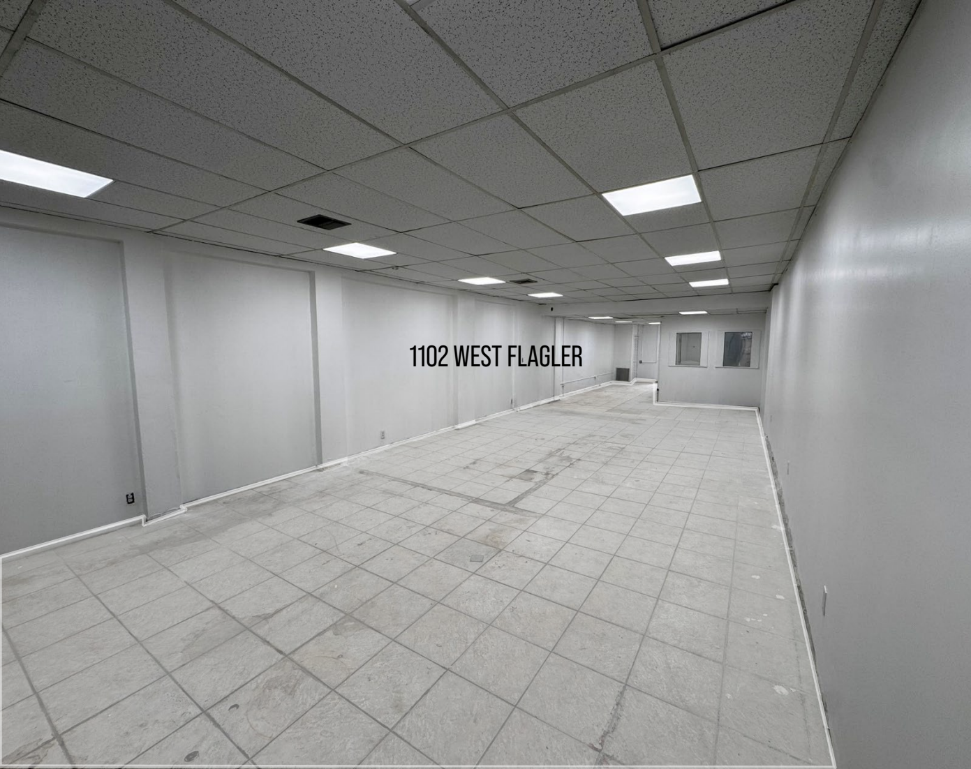
1102 WEST FLAGLER