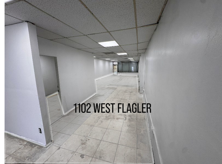
1102 WEST FLAGLER