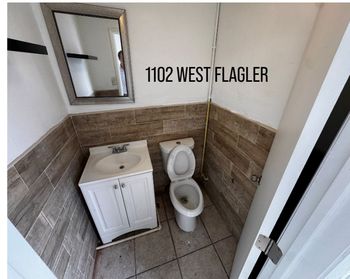
1102 WEST FLAGLER