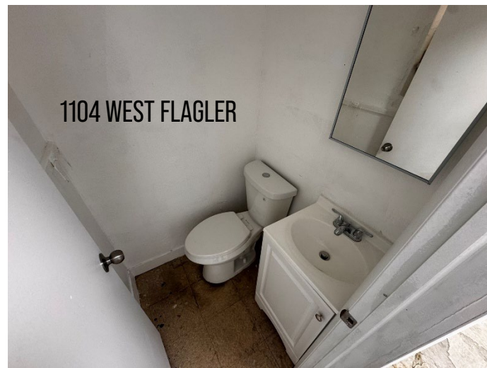
1104 WEST FLAGLER