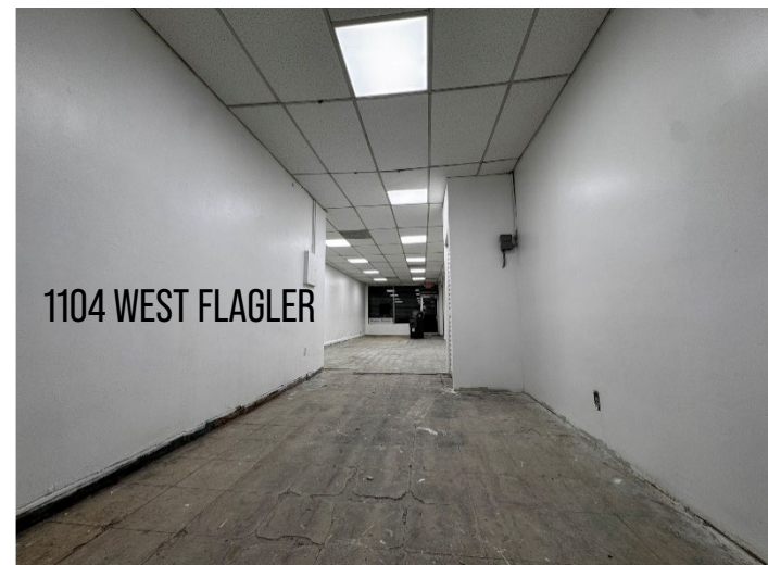
1104 WEST FLAGLER