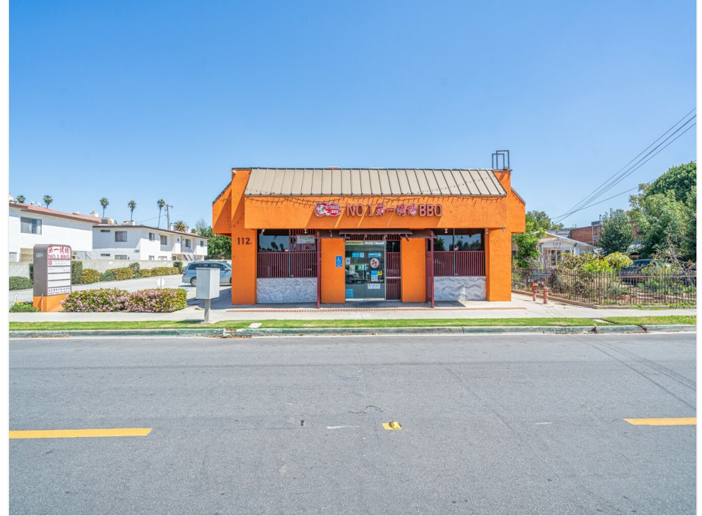
A Prominent Plaza