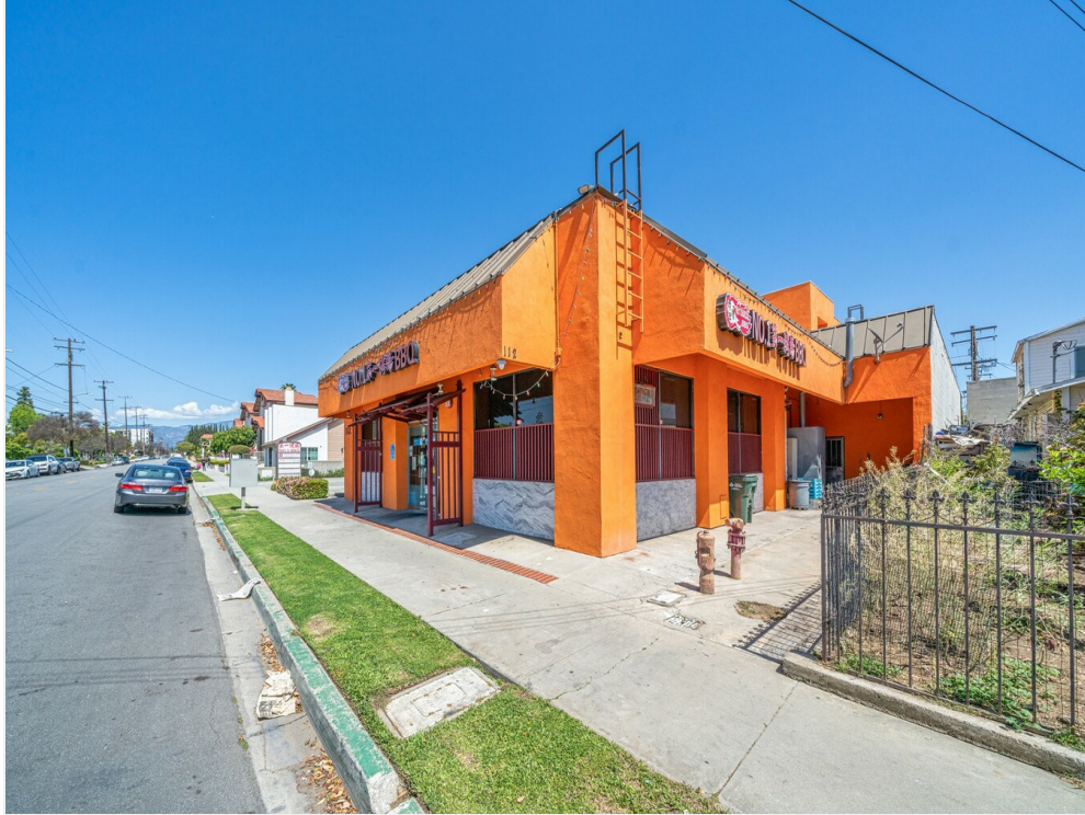
Anchored by a Restaurant at Garvey Ave