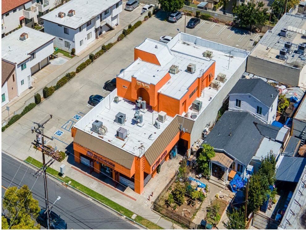
No Hassle of Leaking