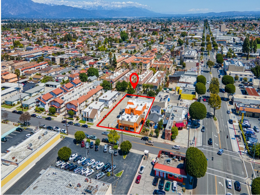
Easy Access to 10 fwy, 60 fwy and 710 fwy