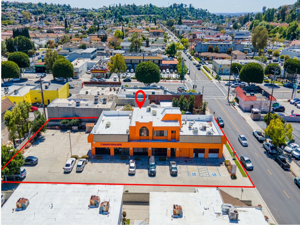
5 Long-term Renters