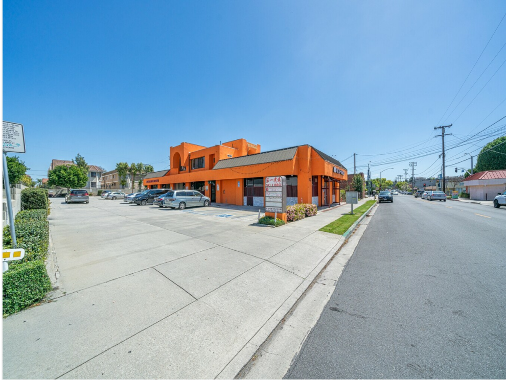
Rare-seen on Market