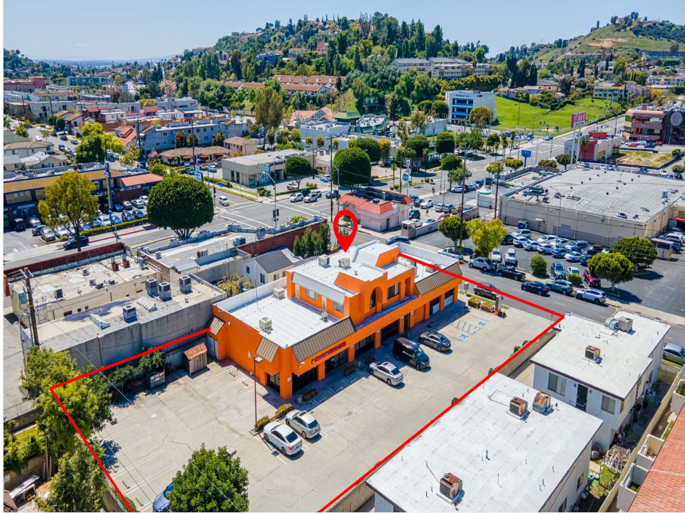
7 Units in Total