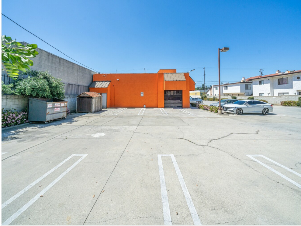
Plenty of Parking Spaces