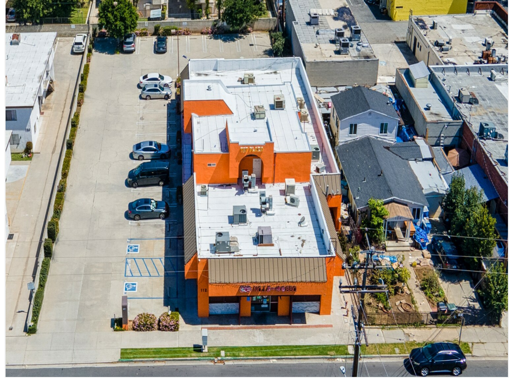
Clean & Sound Roof