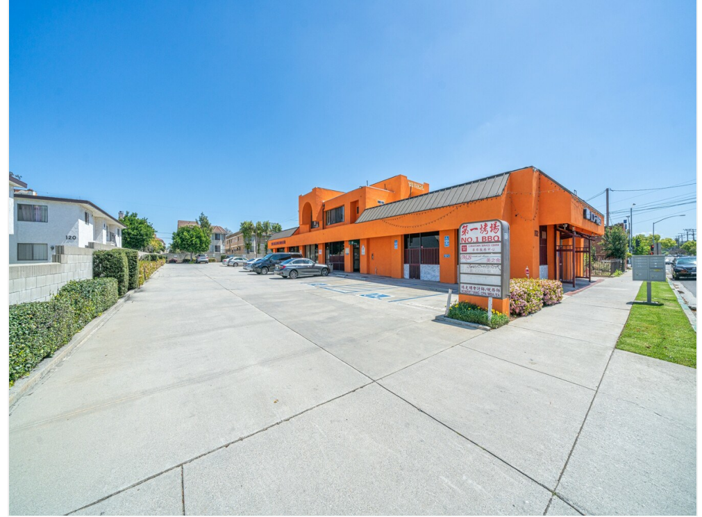
A Rectangular Lot (20,118 sqft)