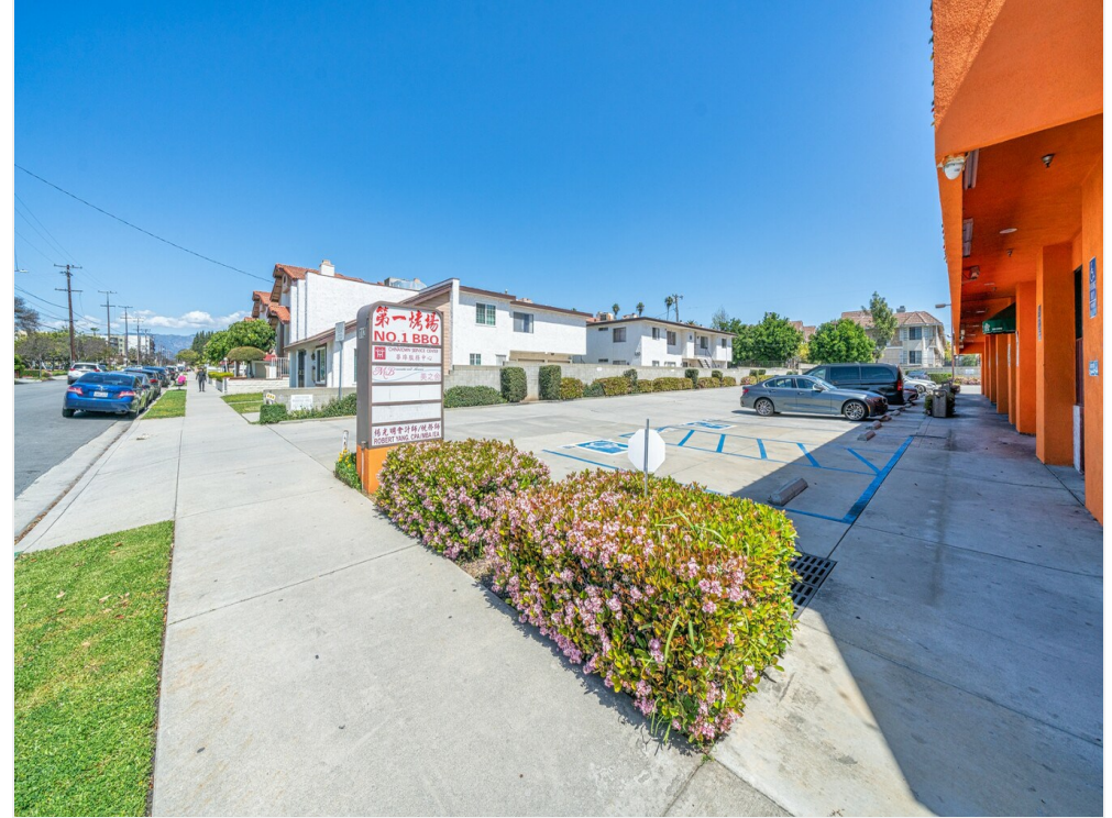
Spacious Parking Lot