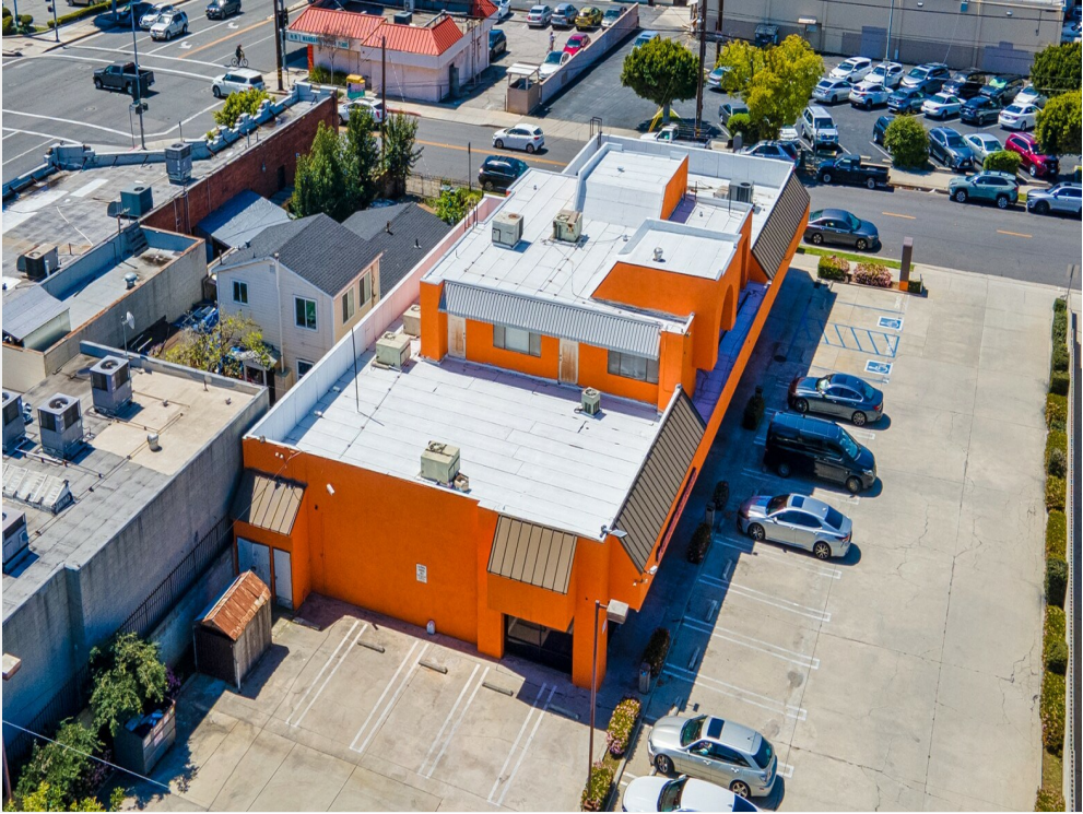
New Roof & New Paints