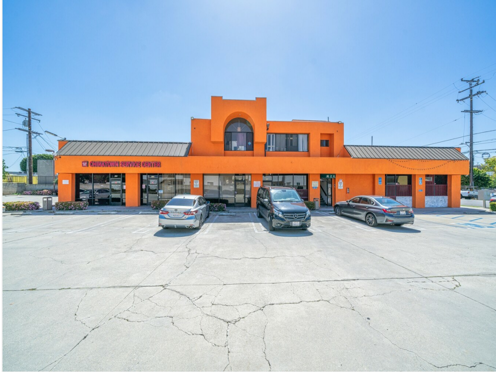
In the Heart of Monterey Park