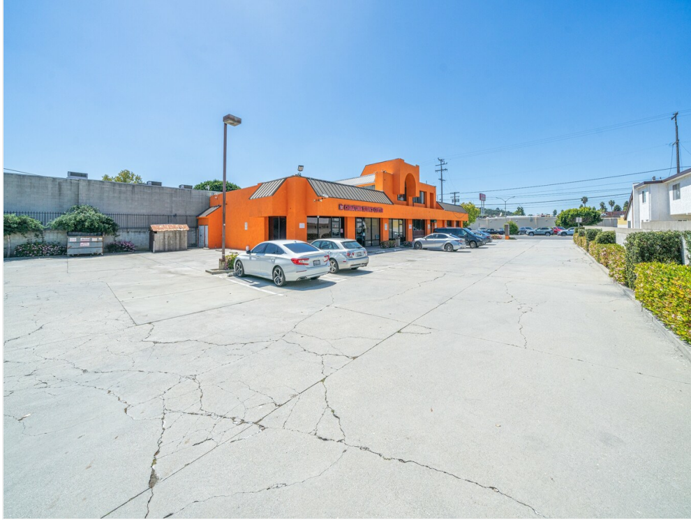
T & T Plaza (7,376 sqft)