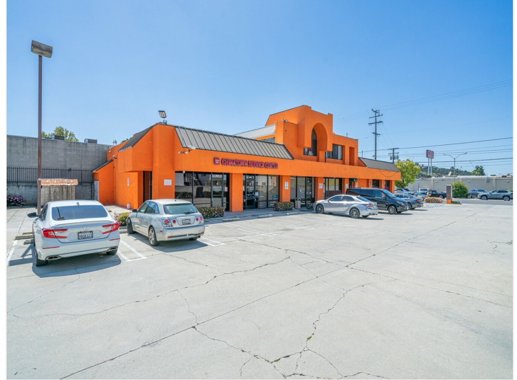
A Free-standing Commercial Building