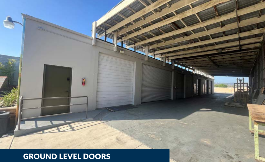
GROUND LEVEL DOORS