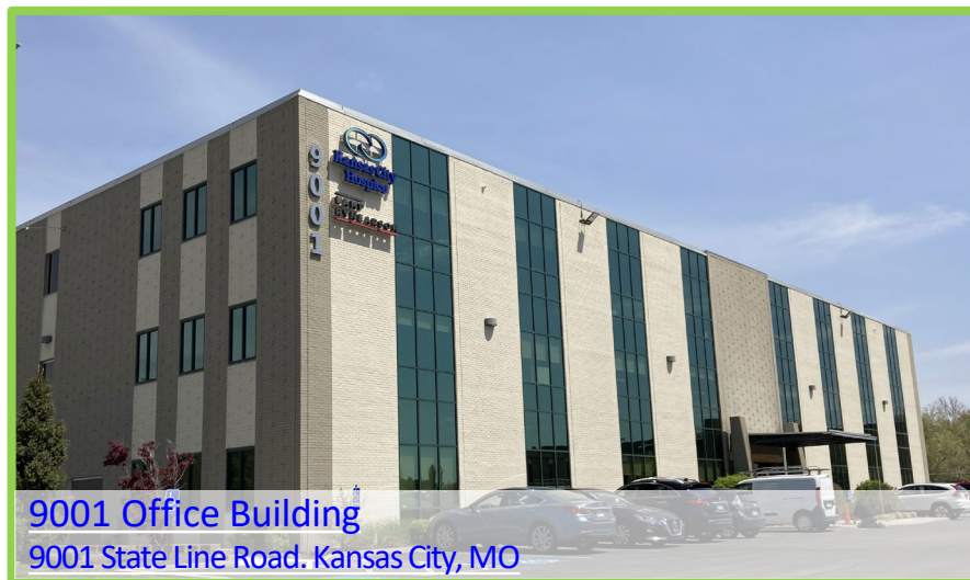
9001 Office Building 9001 State Line Road, Kansas City, MO