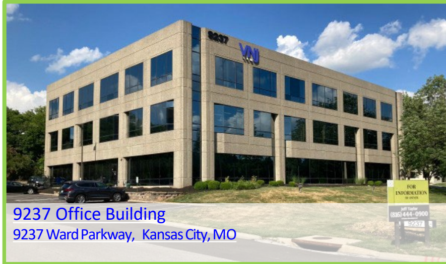
9237 Office Building 9237 Ward Parkway, Kansas City, MO