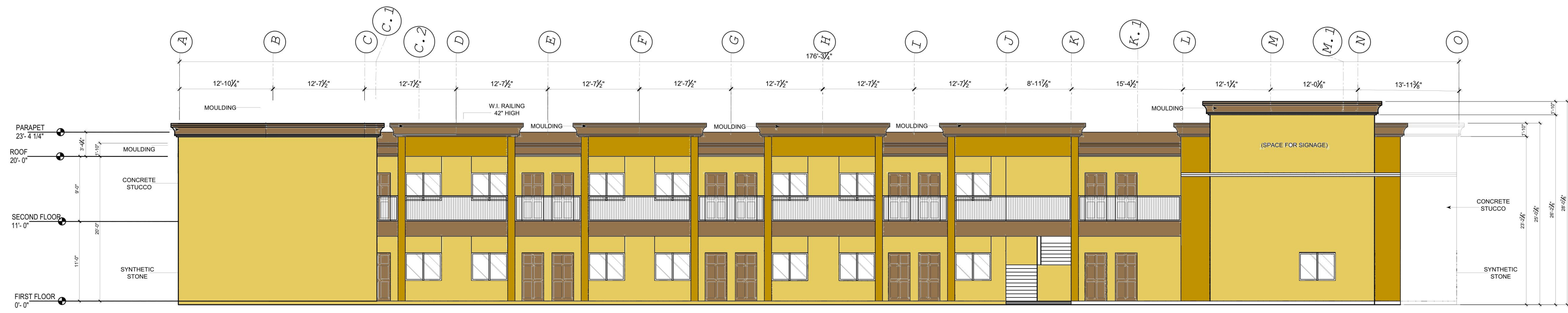
1 ELEVATION SCALE: 1/8"=1'-0"