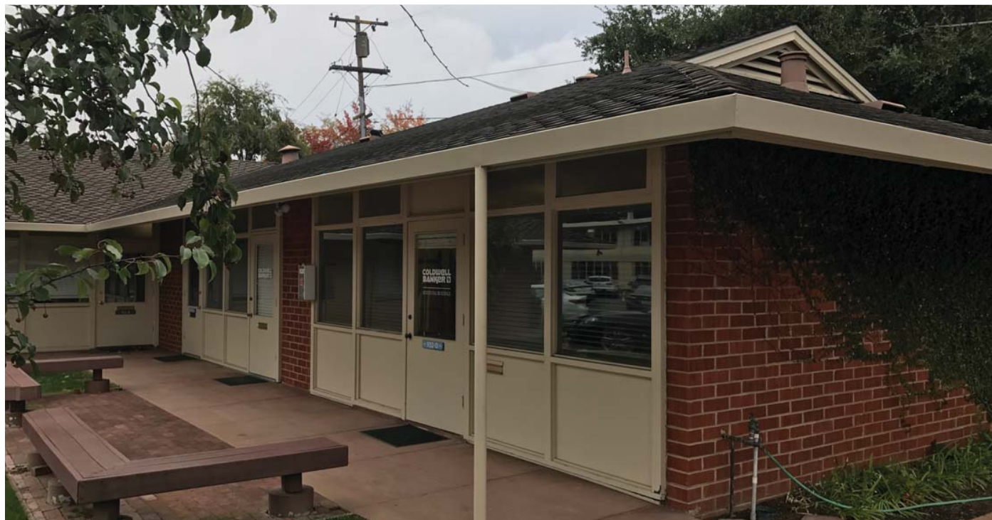
DOWNTOWN MENLO PARK OFFICE