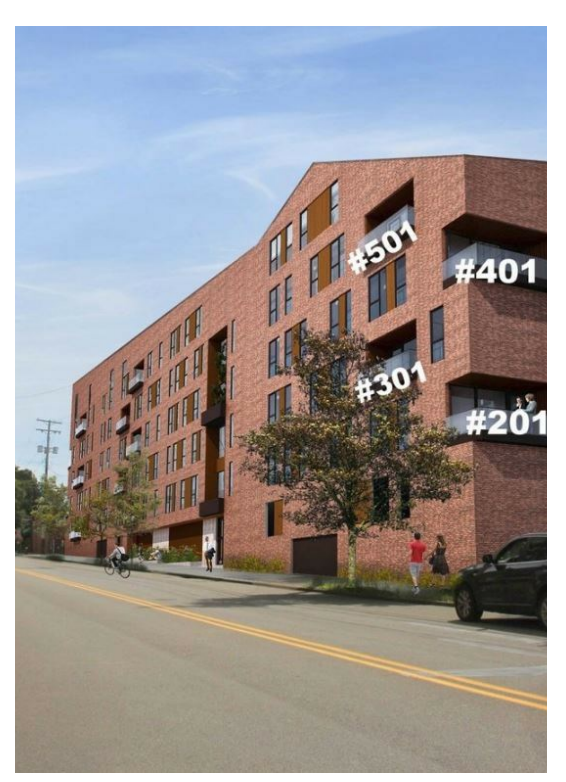
2700 Murray Ave 2700 Murray Ave, Pittsburgh, PA 15217