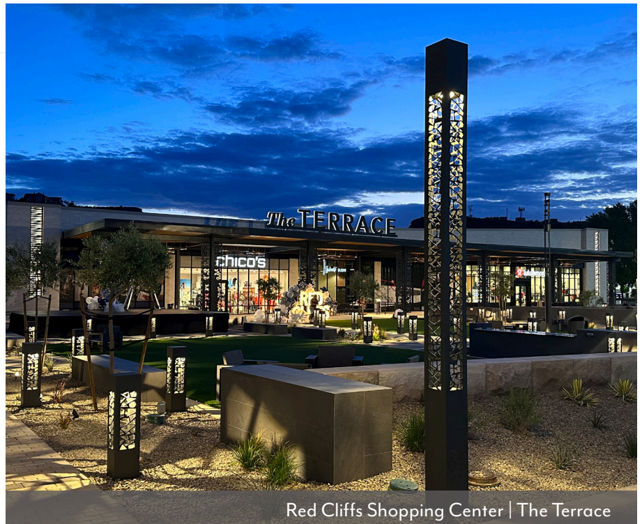
Red Cliffs Shopping Center | The Terrace

The area around the Red Cliffs Shopping Center in St. George is one of the highest-traffic zones, making it a prime spot for exposure to residents and visitors. Here's why this area is attractive for businesses: