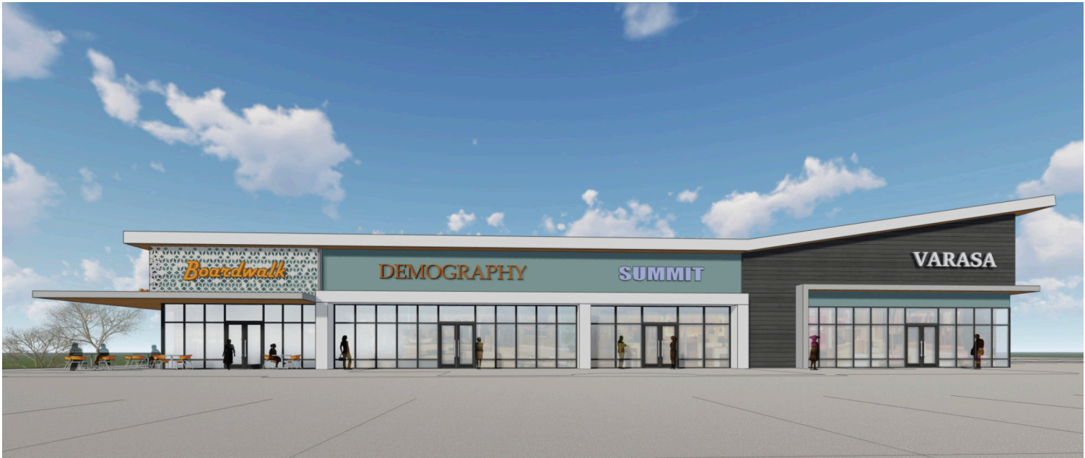
OUTPARCEL INLINE RETAIL CONCEPT DESIGN