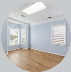
BRIGHT, FRESHLY RENOVATED OFFICES