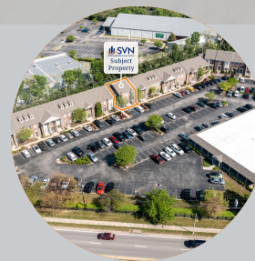
AMPLE CLIENT PARKING